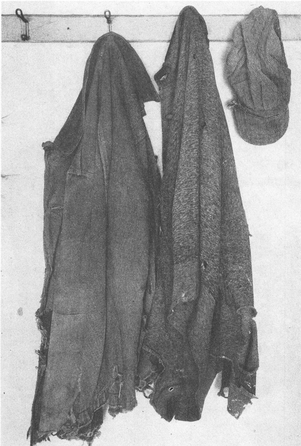
Fig. 3. — The Home Place , p. 133