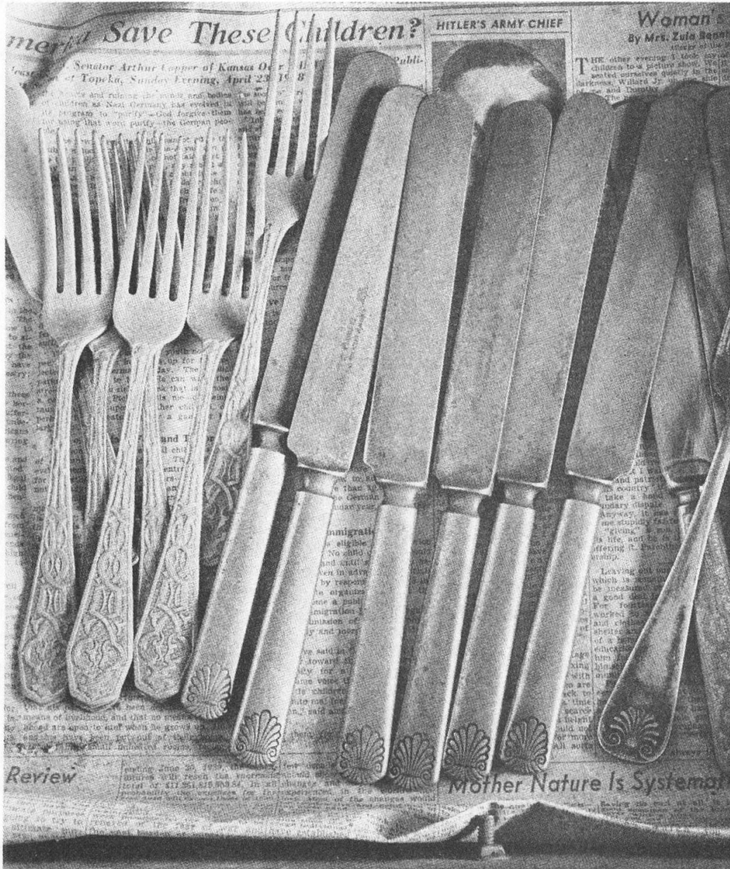
Fig. 2. — The Home Place , p. 39