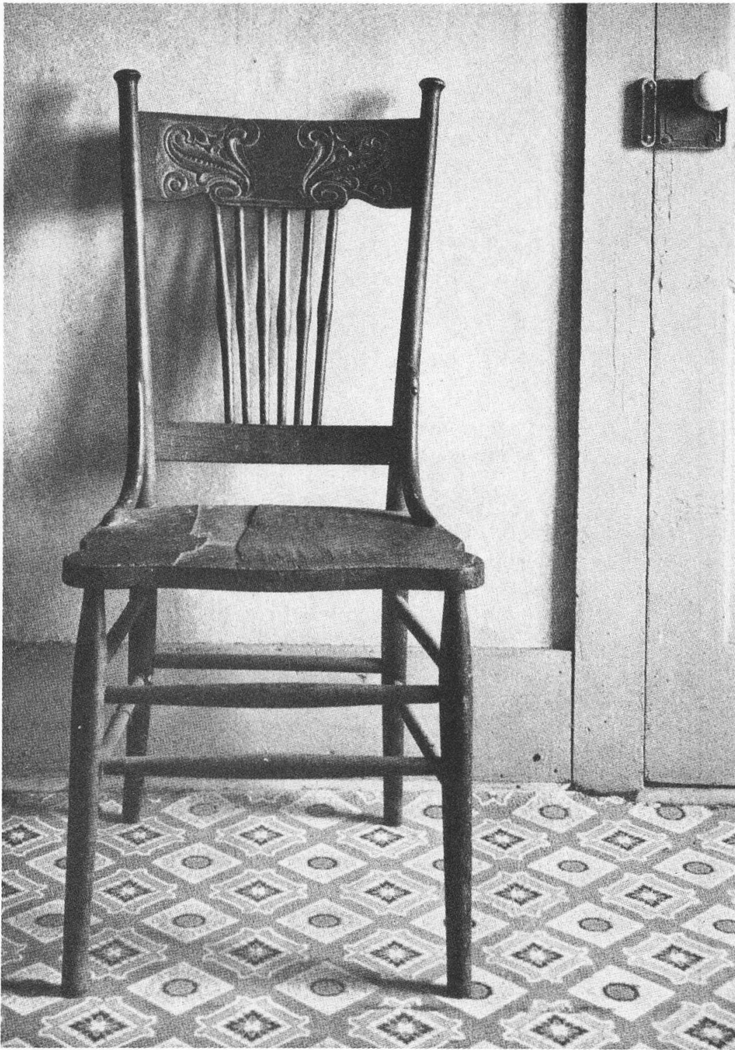
Fig. 5. — The Home Place , p. 40