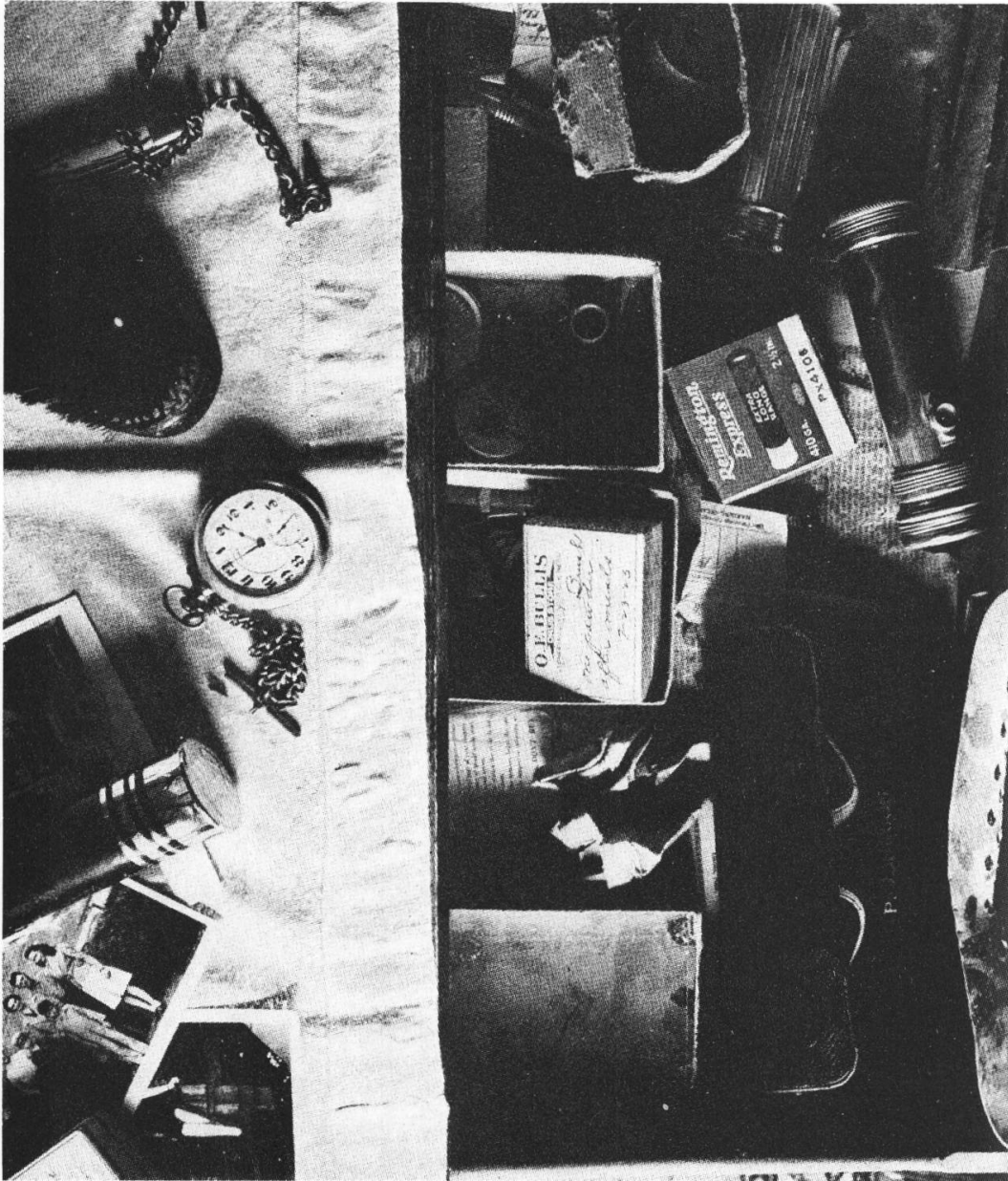
Fig. 4. — The Home Place , p. 140