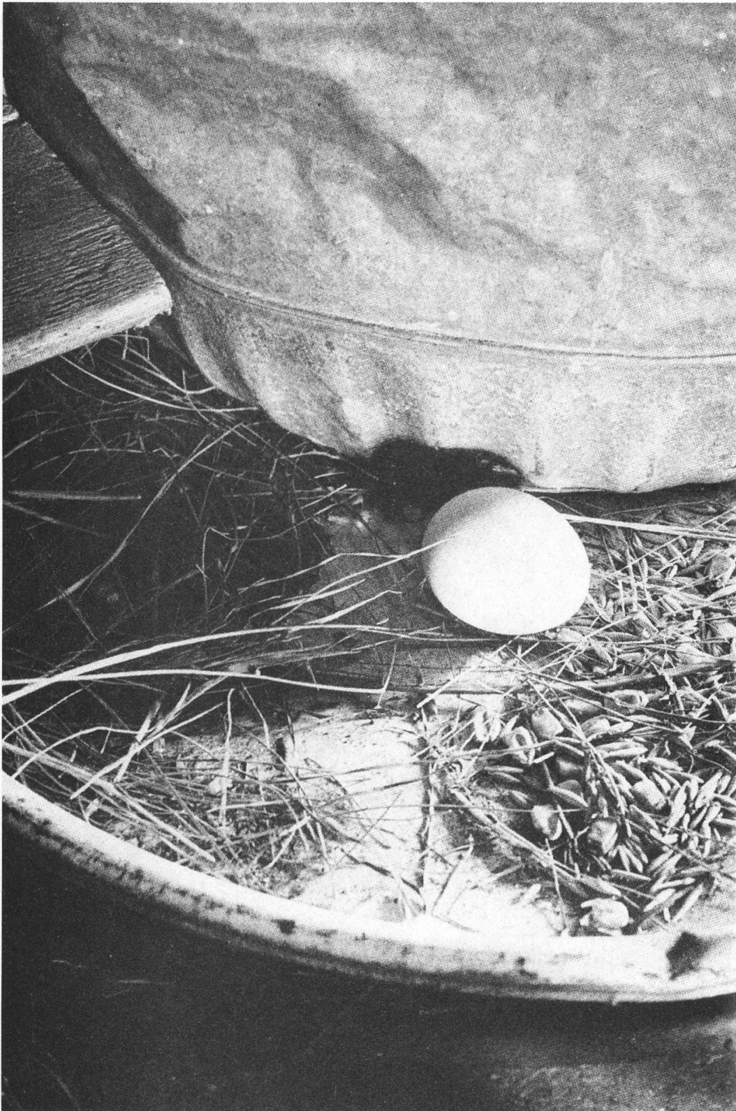
Fig. 1. — The Home Place , p. 10