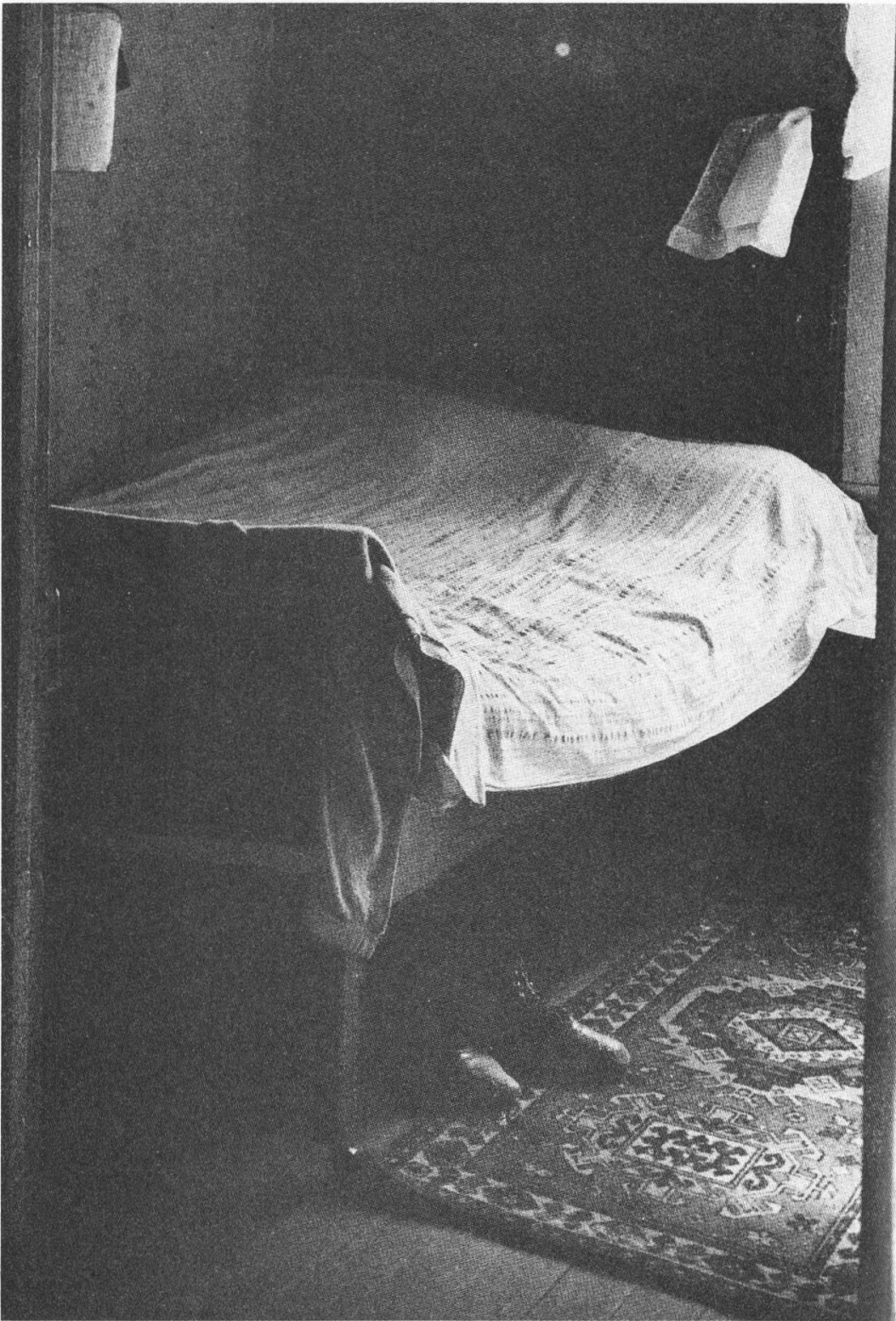
Fig. 7. — The Home Place , p. 134