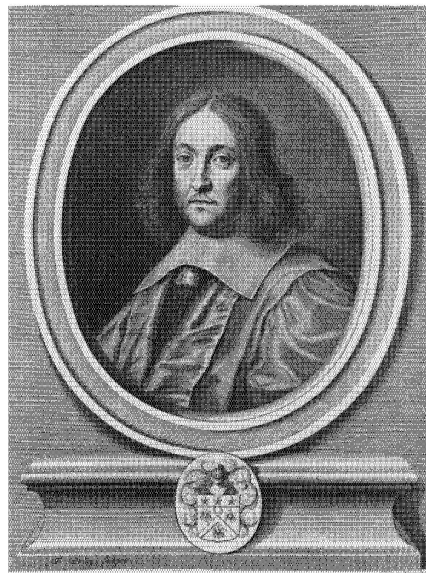
Fig. 1 Pierre de Fermat

The aim of this paper is to relate something of what happened in the three-and-a-half centuries between these two pronouncements, and, in particular, to describe some of the drama and the ideas connected with Wiles' proof.