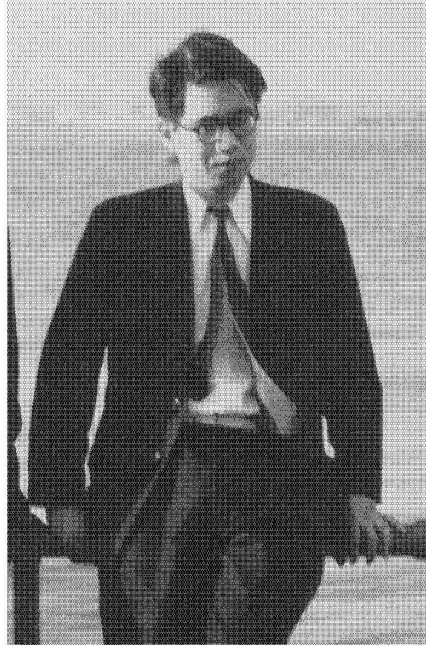
Fig. 5 Yutaka Taniyama