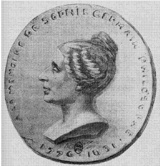
Fig. 2 Sophie Germain

The next strides in the proof of FLT were made by Legendre and Dirichlet, who, around 1825, independently established the theorem for n = 5 . In 1839, Lamé proved it for n = 7 . Incidentally, in 1832 Dirichlet showed that FLT holds for n = 14 but could not prove it for n = 7 ; the latter result, as we noted, implies the former.