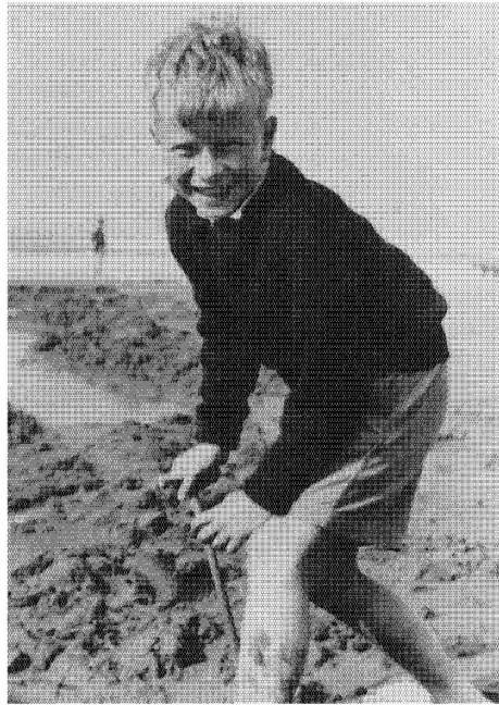
Fig. 3 Andrew Wiles in his childhood

Number theory and geometry, in particular diophantine equations and geometry, have been associated for about two millennia. In fact, it has been argued that the methods of Diophantus (ca. 250 AD) for the solution of diophantine equations could be viewed as geometric; these came to be known as the “tangent and secant methods” [4].