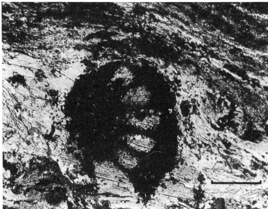
Fig. 4. Foraminiferal or algal fragment (scale is 0.1 mm).