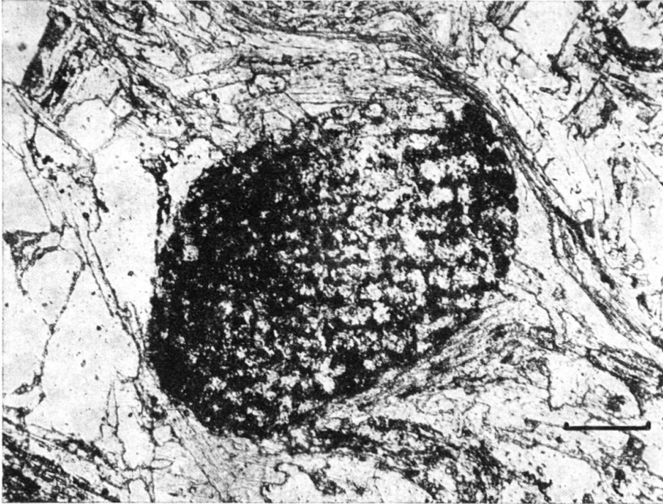
Fig. 2. Echinoderm debris (scale is 0.1 mm).