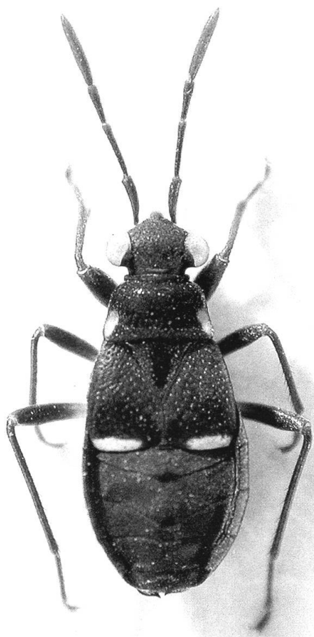
Fig. 1. Courtesius nepalensis sp.nov., holotype female.