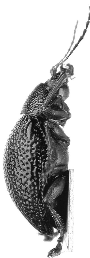
Fig. 2. Iphimoides fabianae sp.nov.: paratype ♀, lateral view.