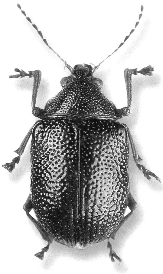
Fig. 1. Iphimoides fabianae sp.nov.: paratype ♀, dorsal view.