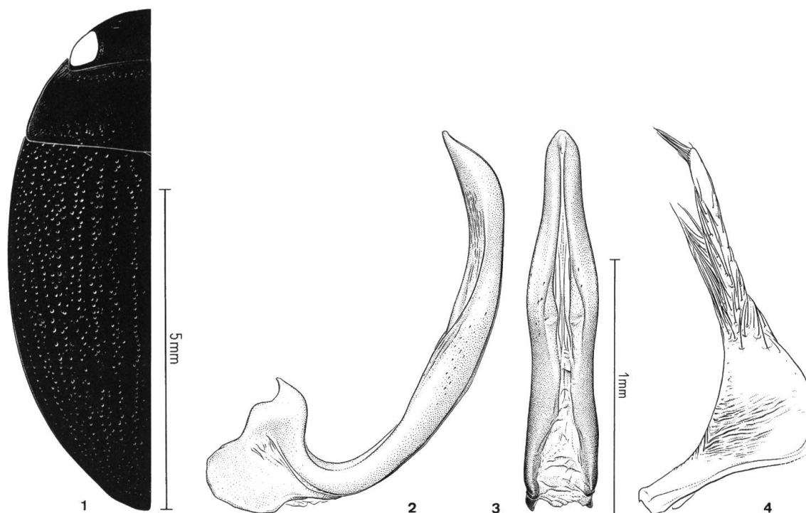
Figs 1–4. Platambus wangi sp.nov.: 1, habitus; 2–3, aedeagus in lateral and dorsal views; 4, left paramere (in the sense of MILLER & NILSSON 2003).

Head black with a bronze lustre, anterior part of vertex and labrum ferrugineous. Microstructures coarse; reticulation consisting of medium-sized polygonal meshes, irregular in size, with 1–3 small punctures on their inner sides and numerous larger punctures on many of the intersections, particularly numerous on disc. Row alongside eyes oblique and clypeal grooves rounded, both consisting of large and confluent punctures. Antennae testaceous, joints elongate, the fifth 2 times as long as broad.