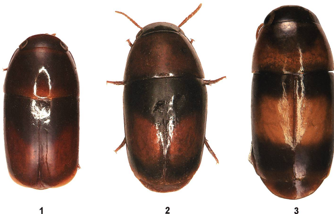
Figs 1–3. 1 – Cryptocephalomorpha laosensis sp.nov.; length 5.5 mm. 2 – Cryptocephalomorpha ovalis sp.nov.; length 5.0 mm. 3 – Cryptocephalomorpha indica sp.nov.; length 3.3 mm.

short setae. Antennal groove moderately deep, comparatively short. Mental tooth moderately wide, elongate, obtuse at apex. Wings of mentum wide, laminate, widely rounded at apex. Glossa large, apparently completely fused with paraglossae to a moderately wide, tongue-like, far-protruding plate with convex apex that is ventrally keeled and quite downwards-inclined. Glossa at apical margin with around eight fairly long setae, dorsal surface apparently without hairs. Lacinia inconspicuous, almost indiscernible. Galea narrow and fairly elongate, fusiform. Terminal palpomere of maxillary palpus elongate and almost parallel-sided, sparsely pilose. Terminal palpomere of labial palpus very large and wide, remarkably securiform, more than twice as long as wide, quite densely pilose. Antenna apparently short and wide, depressed, but both antennae broken after the antennomere 4 or 5. Microreticulation on dorsal surface absent, surface not perceptibly punctate, impilose, highly lustrous. Gula impilose.