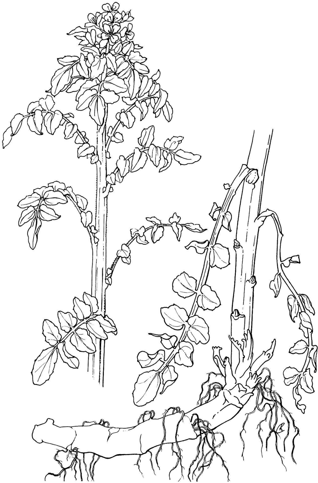
Fig. 4. Cardamine amara ssp. opizii .