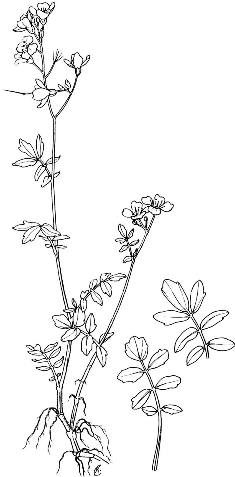
Fig. 3. Cardamine amara ssp. amara .