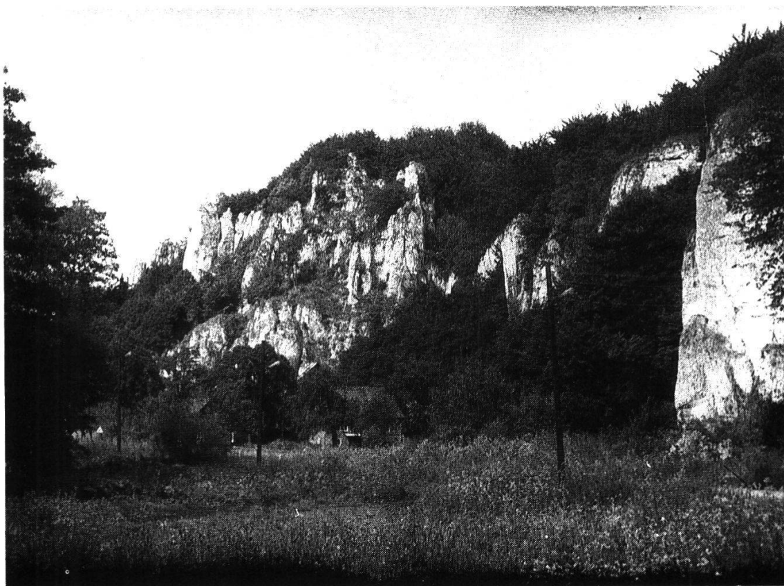
Fig. 4. The Pradnik river valley in the Ojcow National Park. Rocks with Festucetum pallentis and the xerothermic brushwood Peucedano cervariae-Coryletum ; unmown meadows with Cirsium oleraceum in the foreground.

a - acid podzolic soil, b - neutral soil (brown forest soil, rendzina soil, etc.).