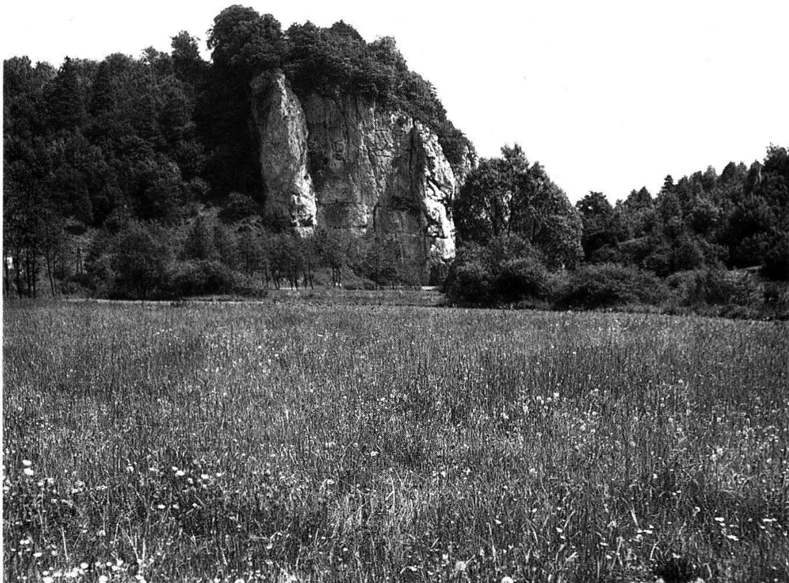
Fig. 1. Limestone rocks in the northern part of the Ojcow National Park. In the foreground a mown meadow of the Arrhenatheretum elatioris association. Photo by A. Medwecka-Kornas, 1962.

More than 950 species of vascular plants of very different ecological requirements occur in the Ojcow N.P. (MICHALIK 1978). There are more than 50 mountain species among them (e.g. Aconitum moldavicum , Centaurea mollis , Dentaria glandulosa [= Cardamine glanduligera ], Polystichum aculeatum , Valeriana tripteris , etc.). There are also very many xerothermic elements of southern and southeastern origin (e.g. Aster amellus , Campanula sibirica , Cirsium pannonicum , Elymus hispidus [= Agropyron intermedium ], Festuca rupicola [= Festuca sulcata ], Melica transsilvanica , Prunus fruticosa [= Cerasus fruticosa ], Stipa joannis , Thymus glabrescens , Veronica austriaca , etc.). Locus classicus of Betula oycoviensis , a controversial taxon formerly believed to be a local endemic, is situated in the lower part of the Pradnik Valley (STASZKIEWICZ and WOJCICKI 1992, this volume).