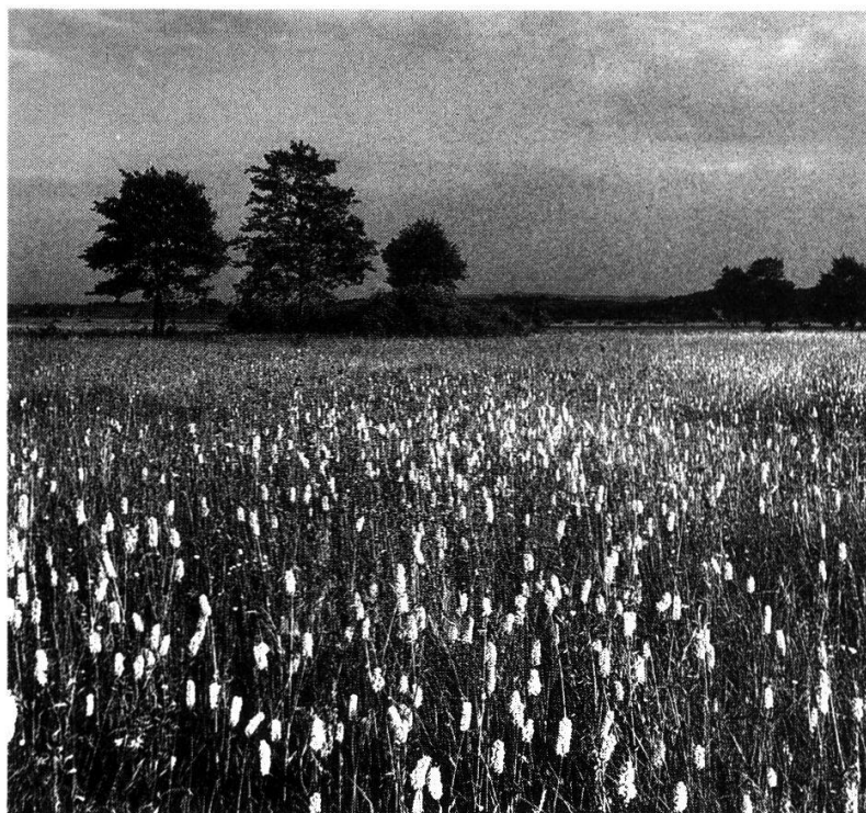
Fig 3. Wet meadows with Polygonum bistorta and Cirsium rivulare in the Rudawa river valley at Zabierzow, state in 1966. At present, a great part of this area has been drained and changed into arable land.