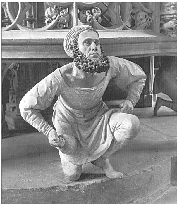
Fig. 4: Adam Kraft, Self-Portrait at base of Eucharistic Tabernacle, St. Lorenz, Nuremberg.