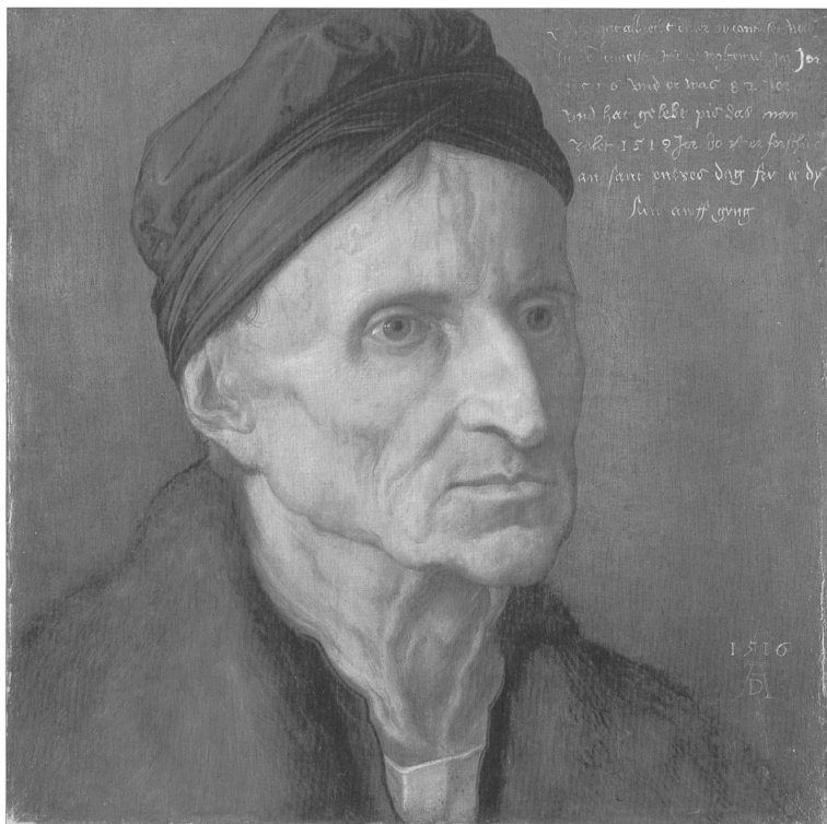
Fig. 7: Albrecht Dürer, Portrait of his Teacher Michael Wolgemut, 1516, Germanisches Nationalmuseum Nuremberg.