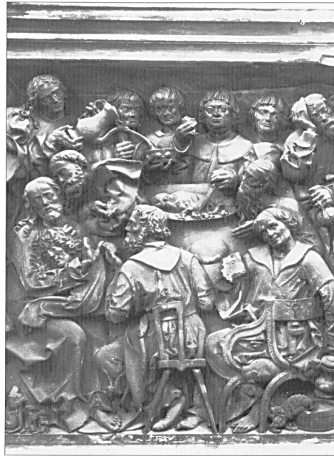
Fig. 9: Veit Stosz, "Last Supper" from Volckammer Relief, St. Sebaldus, Nuremberg, 1499.

he replies that it was the secretary of the city council, Lazarus Spengler, who had joked that Adam was so afraid of biting into the apple that he waited until Eva had lost all her teeth – a reference to Adam's delayed return to Nuremberg and long postponed marriage. 48