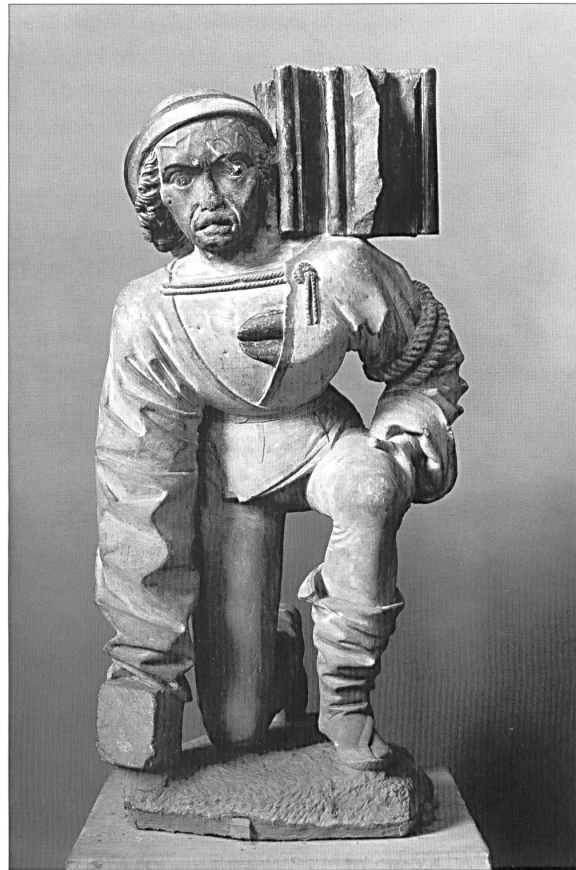
Fig. 8: Anton Pilgram (attr.), Self-Portrait, probably originally supporting a pulpit, ca. 1490, Staatliche Museen zu Berlin.