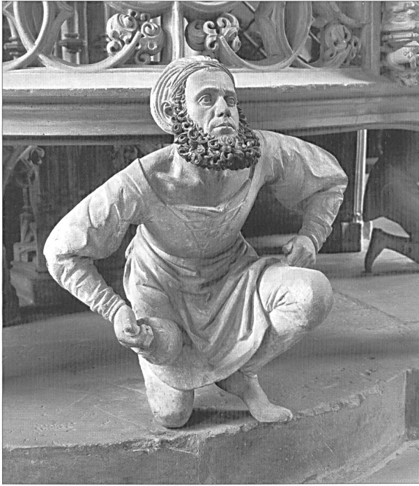
Fig. 4: Adam Kraft, Self-Portrait at base of Eucharistic Tabernacle, St. Lorenz, Nuremberg.