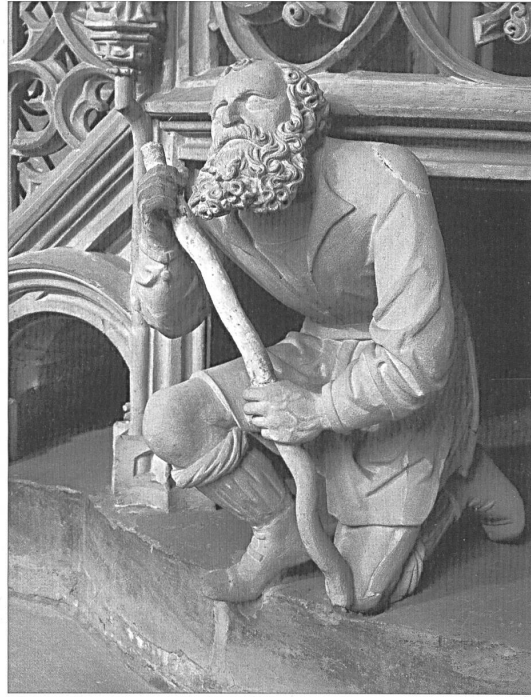
Fig. 5: Member of Kraft Workshop, Self-Portrait at base of Eucharistic Tabernacle, St. Lorenz, Nuremberg.