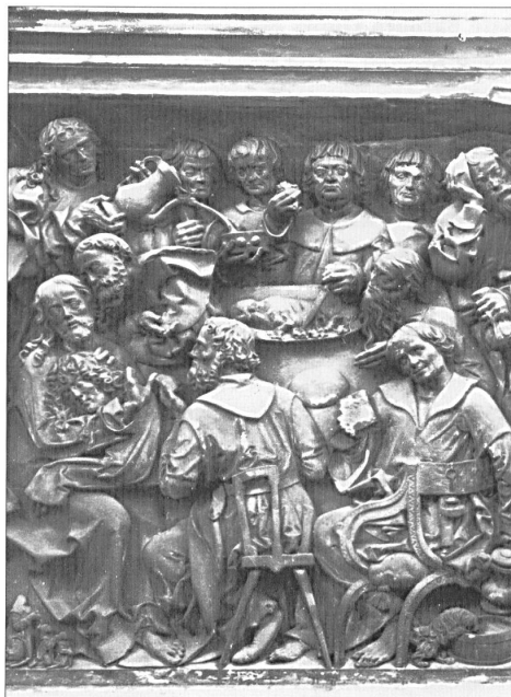
Fig. 9: Veit Stosz, "Last Supper" from Volckammer Relief, St. Sebaldus, Nuremberg, 1499.

he replies that it was the secretary of the city council, Lazarus Spengler, who had joked that Adam was so afraid of biting into the apple that he waited until Eva had lost all her teeth – a reference to Adam's delayed return to Nuremberg and long postponed marriage. 48