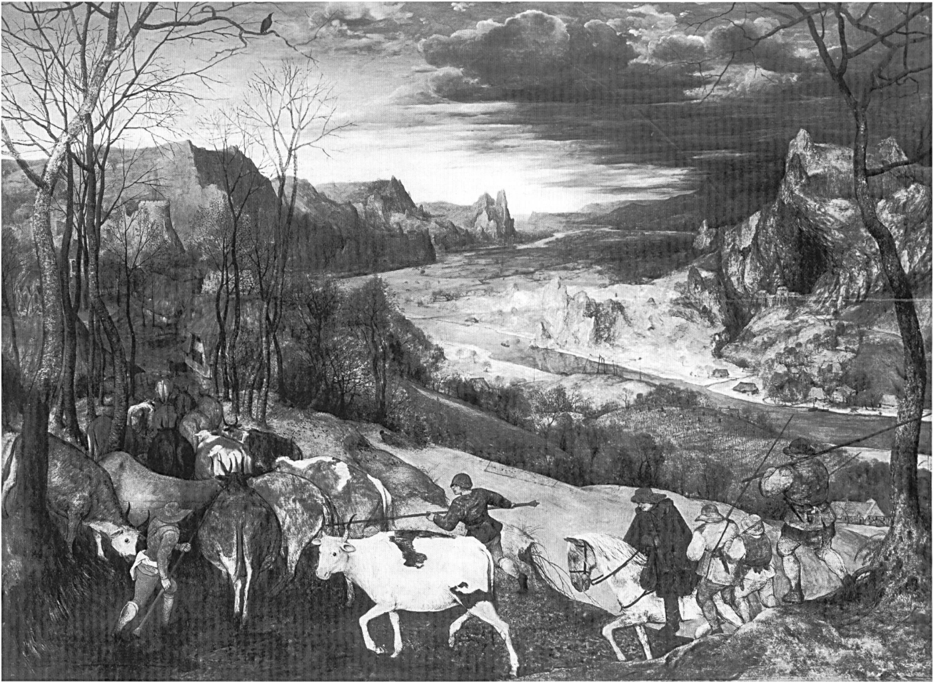
Fig. 5: Pieter Bruegel, "Return of the Herd", 1565, 117 x 159 cm, Vienna, Kunsthistorisches Museum.

quickenning river, these well-muscled drovers drive the herd toward the safety of shelter before the onslaught of the gathering storm. Black clouds amass above the hills on the right, darkening the fields on the far side of the river and providing an opposing movement to that of the drovers. Bruegel therefore articulates the coming of winter through the power of nature's physical might, suggesting thereby the seriousness of the late autumn work. Just as "The Harvesters" posits a similarity between the peasants and natural production, "Return of the Herd" delineates the threat of winter in terms of a resemblance between the forces of man and nature. Active and dynamic, the drovers lean into the wind, conveying the impression of a steady forward movement, a movement which duplicates that of the approaching storm.