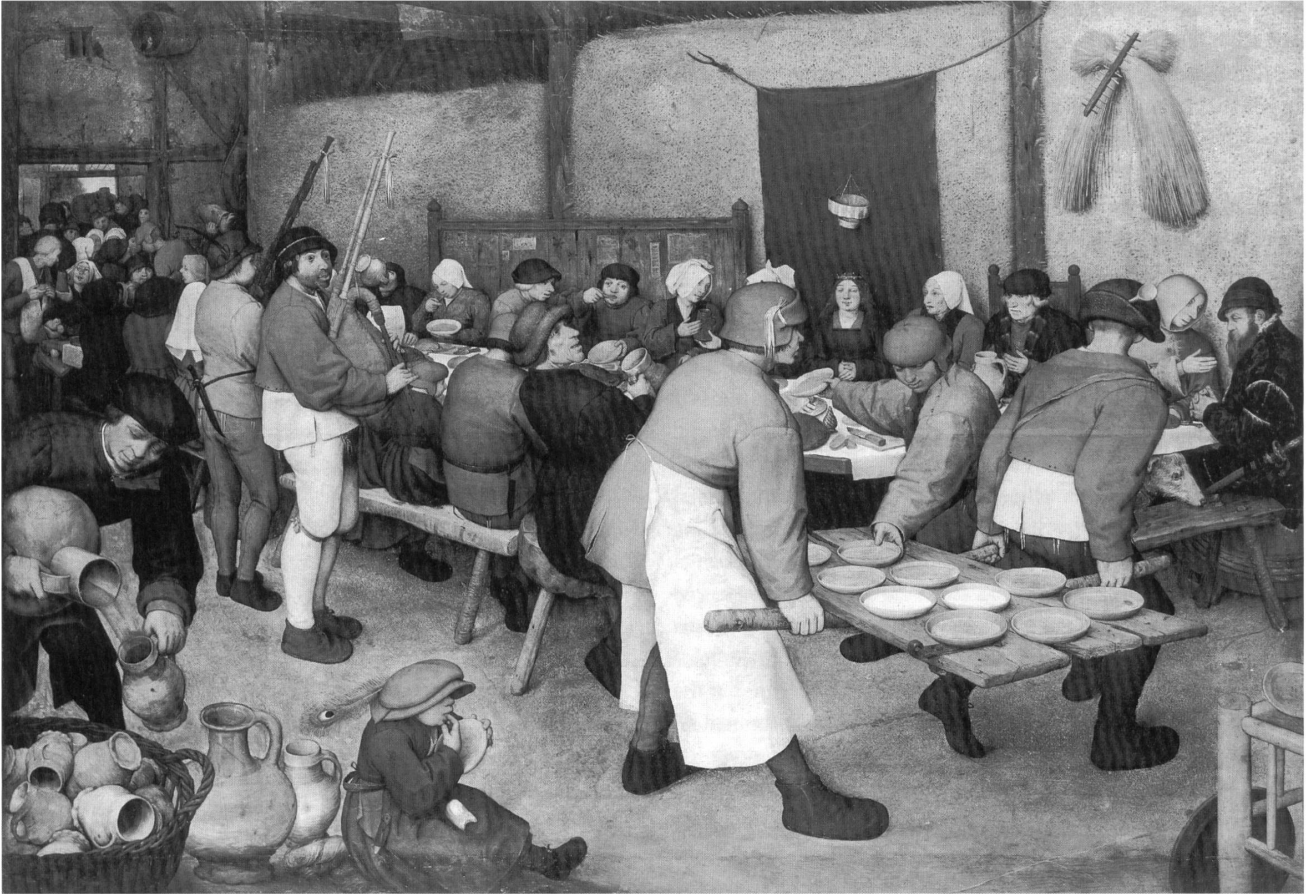
Fig. 3: Pieter Bruegel, "Peasant Wedding", ca. 1568, 114 x 164 cm, Vienna, Kunsthistorisches Museum.