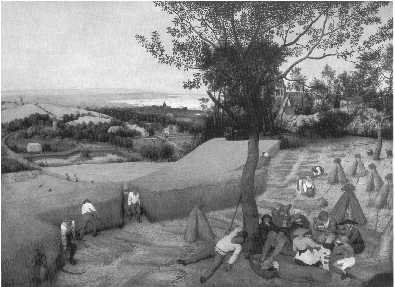
Fig. 4: Pieter Bruegel, "The Harvesters", 1565, 118 x 160,7 cm, New York, The Metropolitan Museum of Art.

transforms the miniature monthly labors into monumental landscapes. On the one hand Jongelinck's commercial empire is imagined in terms of seigneurial land holdings in the tradition of the old nobility, while on the other, the scale and frieze-like character of the "Months" create the impression of an all-encompassing natural world.