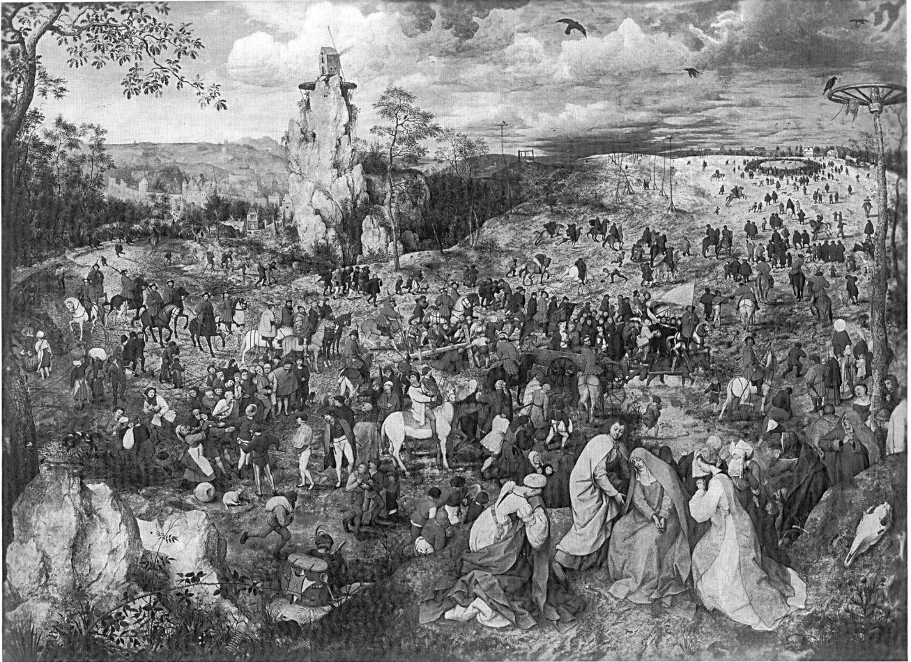
Fig. 2: Pieter Bruegel, "Procession to Calvary", 1564, 124 x 170 cm, Vienna, Kunsthistorisches Museum.