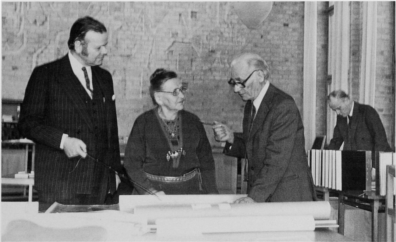
Fig. 2 Many decisive questions concerning Sámi rights have lately been actualized by means of litigation. The picture was taken during the hearing of the Taxed Mountains Case in the Court of Appeal in Sundsvall 1976. From left to right we see the Sámiombudsman, one South Sámi who attended as spectator, a key expert witness, himself a Sámi and professor in Sámi linguistics, and the legal counsel representing the Crown.

In conclusion we may point out that the Sámi codicil of 1751, unlike other legal documents, unites principles related to international law with those based on Sámi customary law. This connection makes the Codicil unique in our time; thereby it is constantly topical, being useful in the most diverse confrontations of interest.