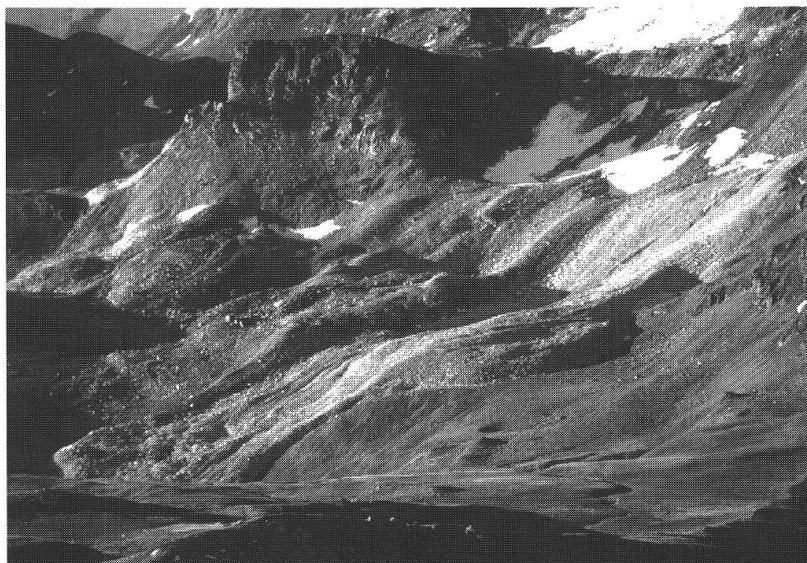
Fig. 1: The Lona glacier/rock glacier complex in the Valais Alps

Explanation: The snout of the formation consists of permanently frozen ground pushed down by a glacier that advanced during the Little Ice Age. Electrical measurements were carried out in this area in 1991. A strong degradation of the frozen ground was observed when repeating the measurements in 2002. The thawing of permafrost is the consequence of the historical dynamics of the formation.