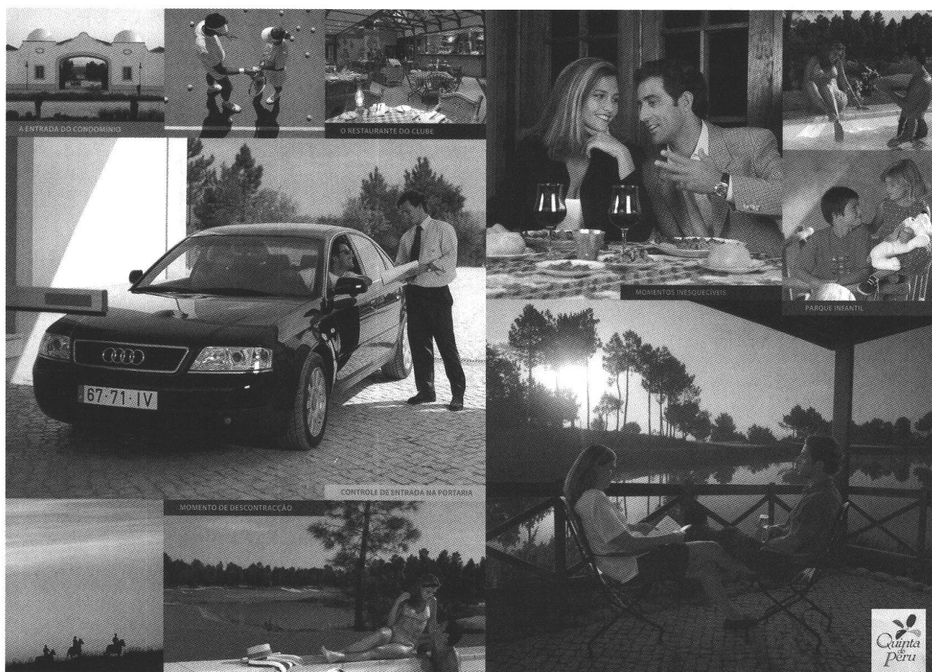
Fig. 2: Excerpts from the promotional brochure of the master-planned condomínio fechado Quinta do Peru Extraits de la brochure publicitaire du «masterplan» du «condomínio fechado» Quinta do Peru Auszüge aus der Werbebroschüre des Masterplans des «condomínio fechado» Quinta do Peru

these areas are a definite plus for their potential association with affluence and modernity.