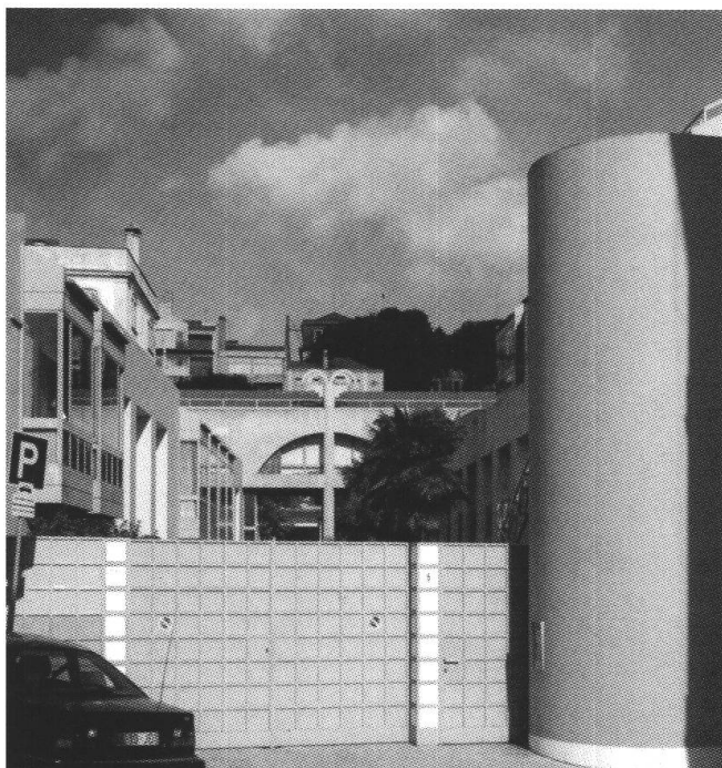
Photo 1: Photo of the access gate of a small condomínio fechado in Lisbon

Photo de la protection d'un petit «condomínio fechado» à Lisbonne