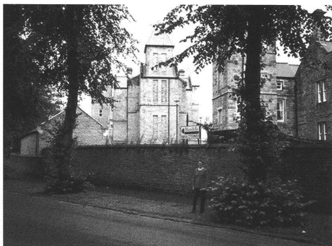
Photo 1: The original workhouse buildings and the surrounding stone wall

Les bâtiments originaux d'indigents, entourés d'un mur de pierre