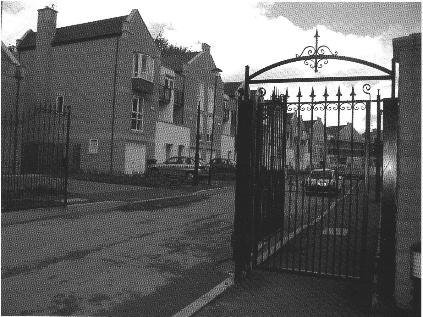
Photo 2: Newly built houses, and access gate Des immeubles nouveaux et une barrière d'entrée Neue Gebäude und eine Einfahrt mit Zugangsbeschränkung