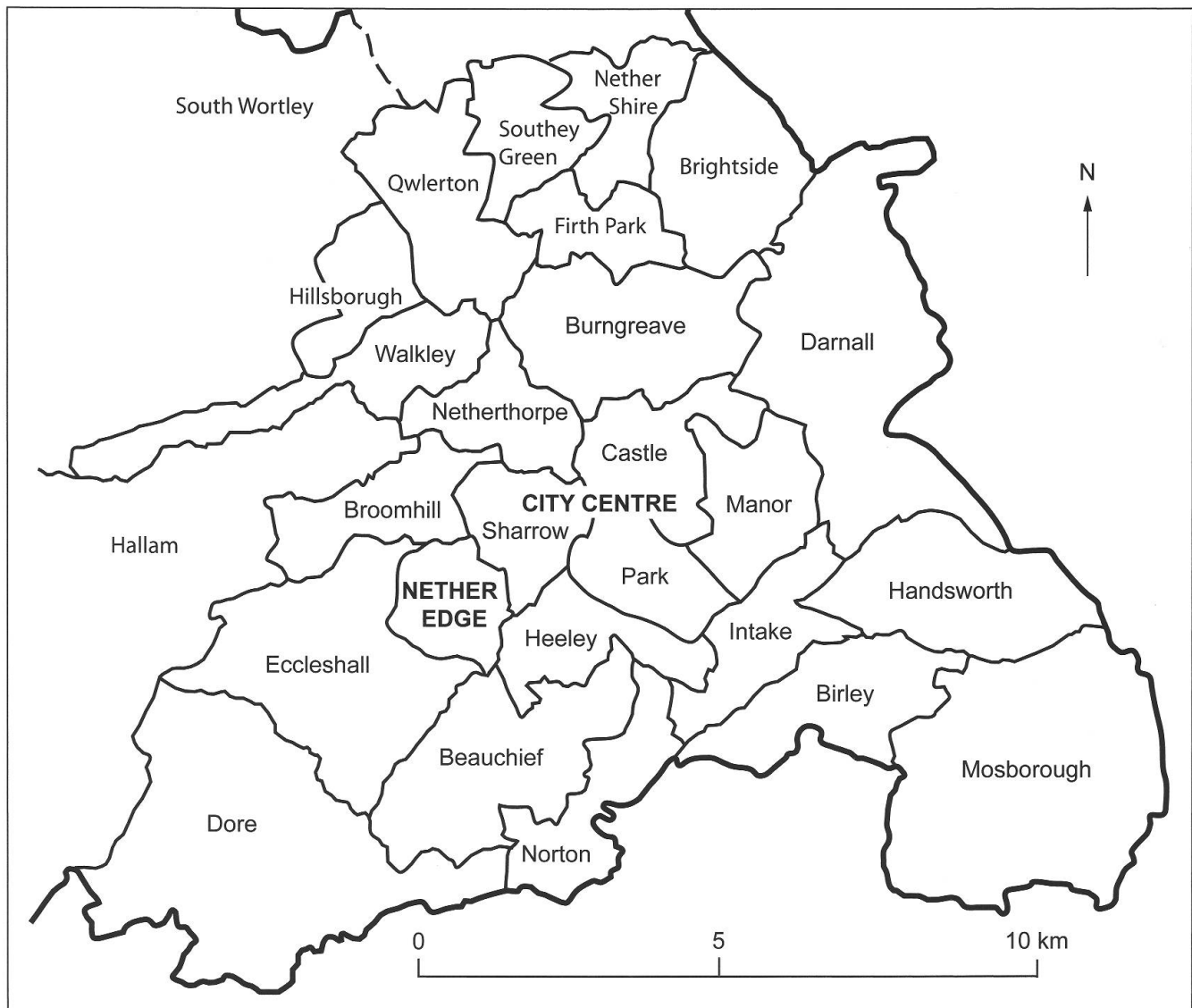
Fig 1: The boundaries of Sheffield local government wards

Les circonscriptions électorales locales à Sheffield