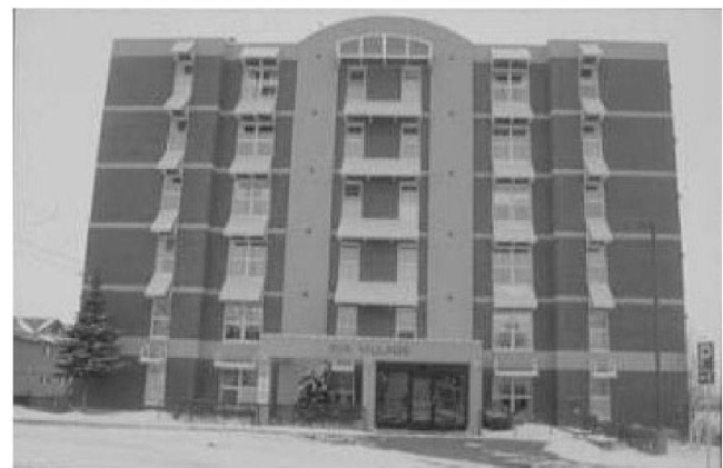
Fig. 3: Non-profit housing Logements sans but lucratif Gemeinnütziger Wohnungsbau

result of market demand, and those that are still mixed buildings including some seniors. Low-income families living in private apartments receive a provincial housing allowance that was established in 1993. Brandon (BRANDON ECONOMIC DEVELOPMENT BOARD 2003) reports that low-income households living in private rental accommodation typically pay rent that is $ 134 per month more than 30 percent of their income. They are forced to either use the food and clothing portion of their provincial allowances on rent, or to move to accommodations that are below the standards adequate for their family needs, such as boarding houses or low-end hotel accommodation.