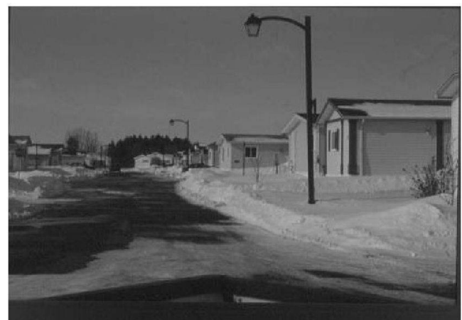
Fig. 1: Seniors' mobile home park Parc de maisons mobiles pour seniors Fertighäuserkomplex für Senioren

At Monterey Estates, a 1,000 square feet home costs Can$ 65,000 including installation on a lot, which is rented for a fee of $ 350 per month, which includes storage space for a recreation vehicle and use of the community centre. The centre provides pool and card tables, big screen television and monthly potluck dinners. Brandon charges a flat $ 502 property tax charge on all mobile homes, two to three times less than a single family home. The developer's literature describes Monterey Estates as providing a secure, stylish, mainte-