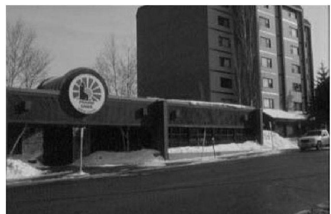
Fig. 2: Public housing unit with seniors' centre attached Logements sociaux joutés d'un centre pour seniors Sozialwohnungen mit angeschlossnem Seniorenzentrum

b) Non-Profit Housing in Brandon is provided by seven organizations and a co-operative housing unit. The units are primarily for persons over 55 although