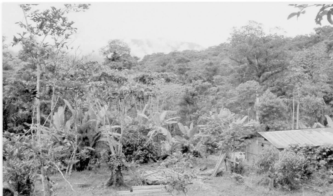
Photo 1: Napints (1,000 m): scattered settlement of the Shuar in the tropical rainforest at the eastern periphery of the Podocarpus National Park

Napints (1000 m): Shuar Streusiedlung im tropischen Regenwald am östlichen Rand des Podocarpus Nationalparks