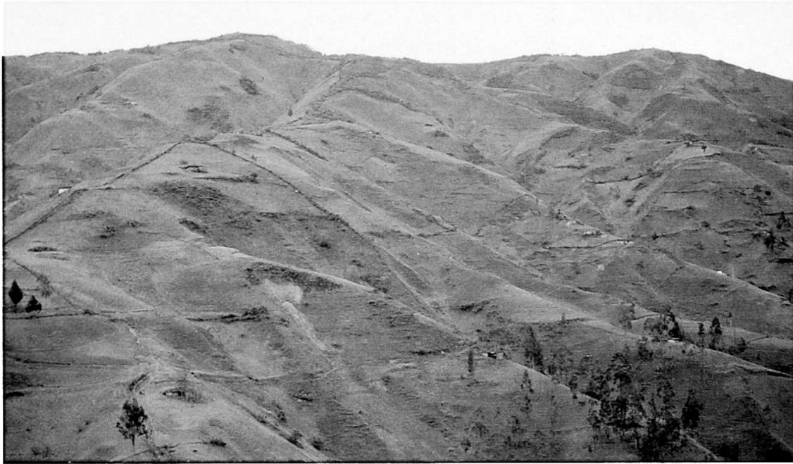
Photo 3: Deforested and overused agrarian landscape of the Mestizo-Colonos north of Loja Entwaldete und übernutzte Agrarlandschaft der Mestizo-Colonos nördlich von Loja Un paysage agricole déboisé et surexploité des Mestizo-Colonos au nord de Loja