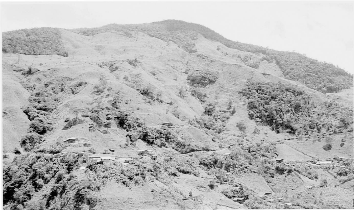
Photo 2: Richly chequered cultural landscape of the Saraguros on a steep slope of the Rio Tibio valley with the scattered settlement of El Tibio (1,770 m)

Reich gegliederte Agrarlandschaft der Saraguro an einer steilen Talflanke des Rio Tibio mit der Streusiedlung El Tibio (1770 m)