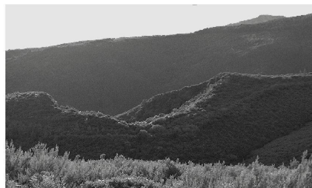
Fig. 3: Boca da Caborca geomorphosite (L07), a landform with «cultural value» as a result of the Roman gold mining

Géomorphosite Cheira da Noiva (L13), un exemple de site granitique ayant une valeur esthétique significative