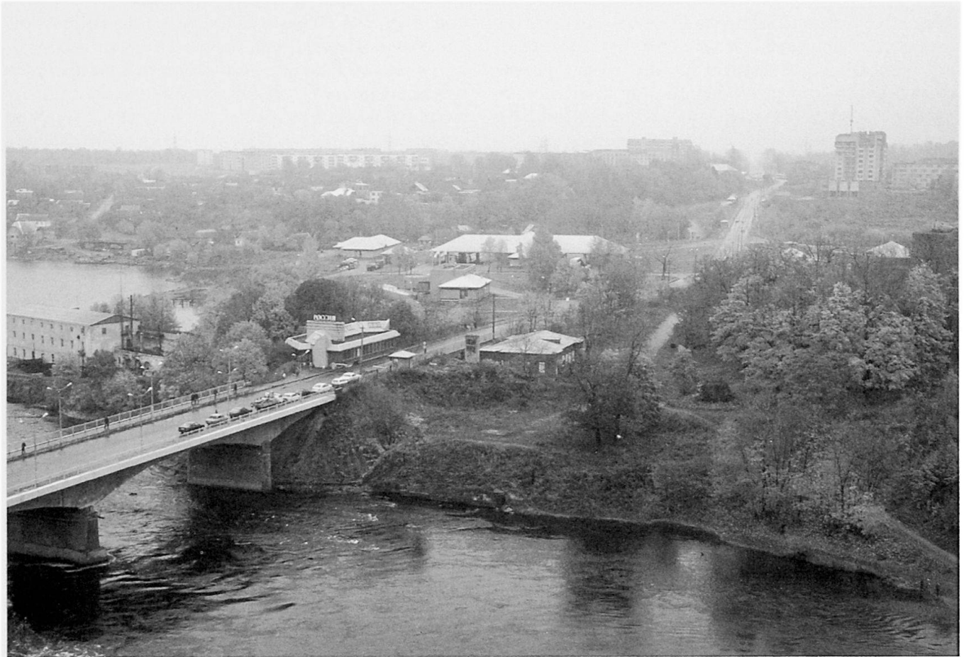
Fig. 2: The Russian border control and Ivangorod as seen from Narva Der russische Grenzposten und Ivangorod von Narva aus gesehen Le poste-frontière russe et Ivangorod vus de Narva 2000