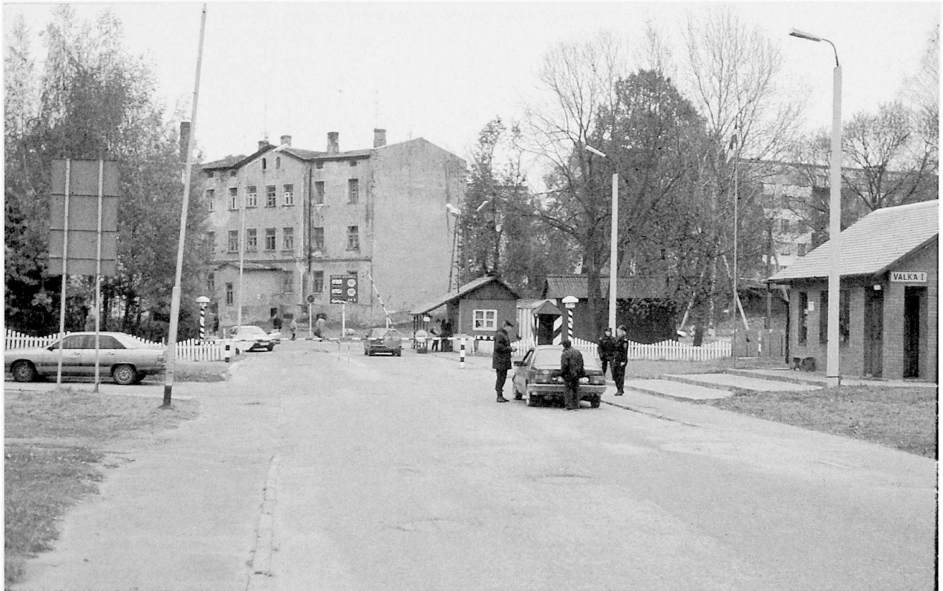
Fig. 3: The Valka/Valga border control as seen from Latvia towards Estonia, before the new EU arrangements Der Valka/Valga-Grenzposten von Lettland aus gesehen in Richtung Estland, vor den EU-Vereinbarungen Le poste-frontière de Valka/Valga vu de la Lituanie vers l'Estonie avant les accords de l'UE Photo: T. LUNDÉN 1999

Orthodox Church and Catholic Cathedral. On the other hand, several graveyards from Soviet times are located in Valka, with graves of ethnic Estonians, Russians and other nationalities. Before independence in 1991, it was quite common that both sport schools and sport clubs had members from both sides of the border. Today, Latvian pupils use to some extent the sport arena and the swimming pool in Valga. Besides language barriers and visa difficulties, border waiting time is a further hindrance to freer movement, especially for the non-citizens.