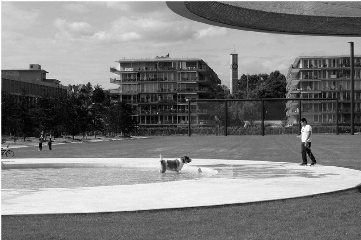
Fig. 3: Water basin at Wahlenpark with ball catch fence and flood light post in the background Das Wasserbecken im Wahlenpark, im Hintergrund das Ballfanggitter und der Flutlichtmast Le bassin du Wahlenpark avec en arrière-plan la barrière et le projecteur

In the following section, attention is given to the ways people sojourning at Wahlenpark deal with these opportunities – what kinds of spaces do park users produce?