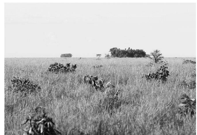
Fig. 3 b: Islands in worm-mound «sartenejal» grasslands, Campo sujo Cerrado grasslands in foreground, Barba Azul Nature Reserve Waldinseln in «sartenejal» Grasland mit Wurmhügeln und Campo sujo Cerrado Grasland im Vordergrund, Barba Azul Naturreservat Îlots forestiers avec monticules herbeux (sartenejal), prairies de Campo sujo Cerrado au deuxième plan, Réserve naturelle de Barba Azul Photo: R. LANGSTROTH, October 2009