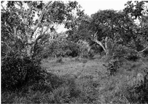
Fig. 4: Cerrado vegetation on semialtura of the Omi river, Barba Azul Nature Reserve, Yacuma Province, El Beni, Bolivia

Cerrado-Vegetation mittlerer Höhenlagen am Omi-Fluss, Barba Azul Naturreservat, Yacuma Provinz, El Beni, Bolivien