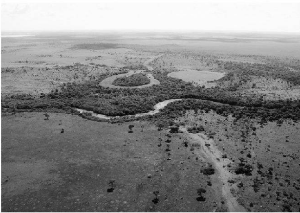
Fig. 2: Llanos de Moxos landscape with forested alturas , sparsely wooded semialtura , and open herbaceous bajío units corresponding to natural levees, backslopes and splays, and flood basins, respectively Llanos de Moxos mit bewaldeten Erhebungen, spärlich bewaldeten mittleren Höhenlagen und offenen krautreichen «bajíos» . Das lokale Relief wird verursacht durch Dammufer, Schwemmfächer und Überflutungsbereiche. Paysage des Llanos de Moxos montrant les hauteurs boisées (alturas), les pentes d'altitudes moyennes faiblement boisées (semialtura) et les espaces herbeux ouverts (bajío) des bassins fluviaux Photo: R. LANGSTROTH, October 2009

NAVARRO 2002). Forests in these dissected «upland» landscapes are limited to narrow stream valleys below the level of the savannas, rather than occurring upon positive relief features as in the southern Moxos landscapes (HANAGARTH 1993). A transitional belt occurs between the Cerrados of the Forebulge and the active whitewater floodbasins where the palaeochannels of the Beni river cut across the plains of southern Moxos, such as at the Barba Azul Nature Reserve (BANR) on the Omi river (Fig. 1 and 4).