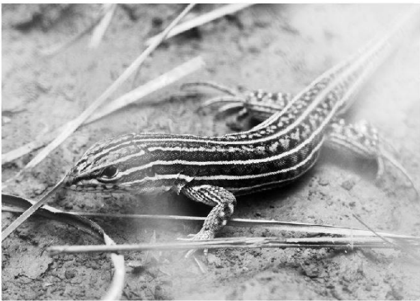
Fig. 6: Kentropyx vanzoi in grassland at Barba Azul Nature Reserve, Yacuma Province, El Beni, Bolivia Kentropyx vanzoi im Grasland des Barba Azul Naturreservates, Yacuma Provinz, El Beni, Bolivien Kentropyx vanzoi dans les prairies de la Réserve naturelle de Barba Azul, Province de Yacuma, El Beni, Bolivie Photo: R. LANGSTROTH, October 2009

Widespread Cerrado ( Chrysocyon brachyurus , Kunsia tomentosus ), grassland ( Blastocerus dichotomus , Euphractus sexcinctus , Ozotoceros bezoarticus ), and habitat generalists ( Hydrochoeris hydrochaeris , Panthera onca , Puma concolor , Tapirus terrestris , Tayassu pecari ) are present. Cryptonanus unduaviensis is a micro-marsupial known only from wooded termite mound islands of the flooded savannas of the Llanos de Moxos and the Huanchaca region (VOSS et al. 2005). The rat Hylaeamys acritus is known only from the savannas of the Beni and Santa Cruz departments of Bolivia (EMMONS & PATTON 2005). The rats Juscelynomyx guaporensis and J. huanchacae were described from the Huanchaca savannas (EMMONS 1999) but are also in the Iténez savannas. In contrast to the Cerrado ties of the above, an unnamed clade of Calomys endemic to the Beni is most closely related to C. fecundus from the Subandean Chaco, not C. callosus of the Cerrados and Chiquitanía (ALMEIDA et al. 2007).