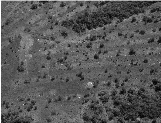
Fig. 7: Abandoned raised fields colonized by shrubs and trees in Cerrado savannas near Iruyáñez River, Yacuma Province, El Beni. White spots are termite mounds.

In der Nähe des Iruyáñez-Flusses, Yacuma Provinz, El Beni, sind aufgelassene Hügelbeete durch Büsche und Bäume der Cerrado-Savanne besiedelt. Weiße Flecken sind Termitenhügel.