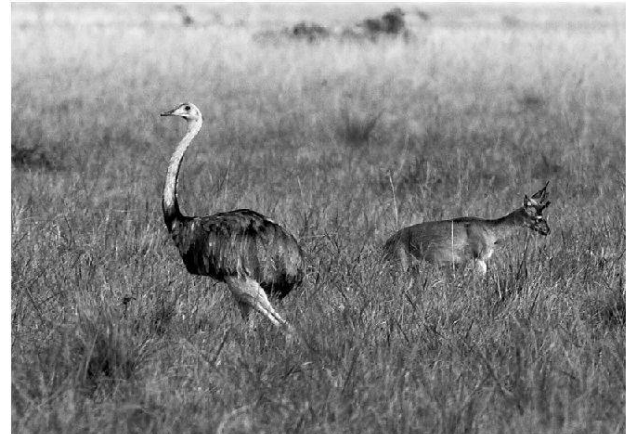
Fig. 5: Southern South American open formation fauna, Rhea americana and Ozotoceros bezoarticus , Barba Azul Nature Reserve, Yacuma Province, El Beni Fauna offener Vegetationsformationen des südlichen Südamerikas, Rhea americana und Ozotoceros bezoarticus, Barba Azul Naturreservat, Yacuma Provinz, El Beni Faune des formations végétales ouvertes méridionales de l'Amérique du Sud, Rhea americana et Ozotoceros bezoarticus, Réserve naturelle de Barba Azul, Province de Yacuma, El Beni