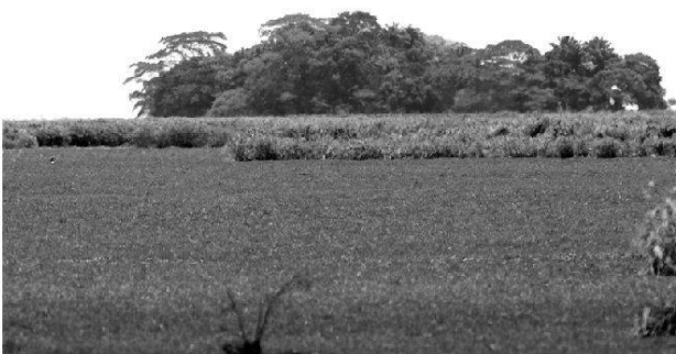
Fig. 3 a: Island in bajío with Cyperus giganteus and Thalia geniculata in foreground, La Chacra, Provincia Cercado Waldinsel in einem «bajío» mit Cyperus giganteus und Thalia geniculata im Vordergrund, La Chacra, Provinz Cercado Îlot forestier dans le bajío avec Cyperus giganteus et Thalia geniculata au deuxième plan (La Chacra, Province de Cercado) Photo: R. LANGSTROTH, December 2003

The Llanos de Moxos fauna includes both forest and open formation elements of diverse origins, including