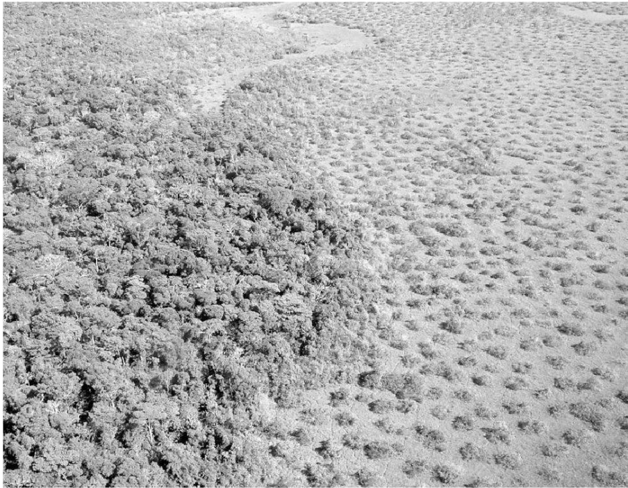
Fig. 1: Ecotone between humid evergreen rainforest and seasonally-flooded termite savanna in Noel Kempff Mercado National Park, NE Bolivia

Ökoton zwischen humidem immergrünem Regenwald und saisonal überfluteter Termitensavanne im Noel Kempff Mercado Nationalpark, Nordost-Bolivien