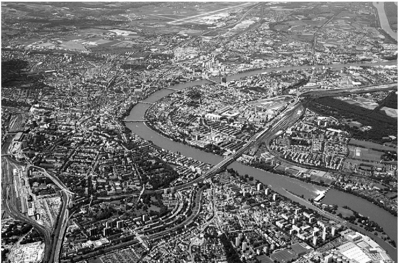
Fig. 4: Many studies at the University of Basel focus on regional economic and spatial development in the trination border region of Basel, Switzerland

Studienfokus auf regionaler Wirtschaftsentwicklung und Raumplanung im trinationalen Grenzraum Basel