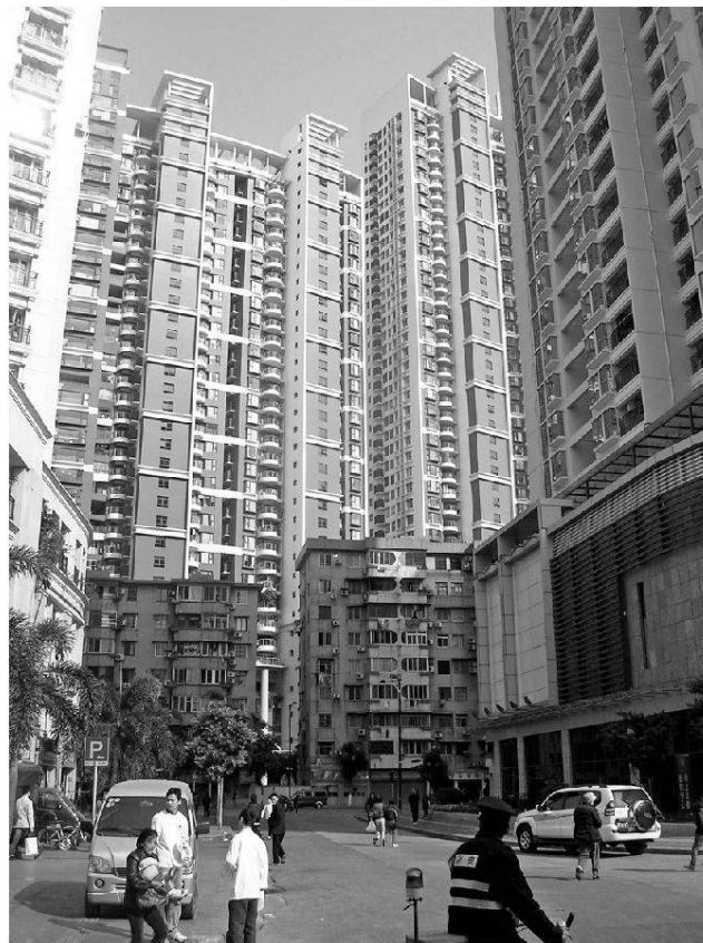
Fig. 3: Architectural contrasts and social disparities in urban China: Xiadu Urban Village in Guangzhou (in the foreground), modern urban riverside development (in the background)

Städtebauliche und soziale Gegensätze im Stadtbild: Xiadu «Urban Village» inmitten von Guangzhou (im Vordergrund), moderne Wohnanlage in Hochbauweise an der Uferpromenade (im Hintergrund)