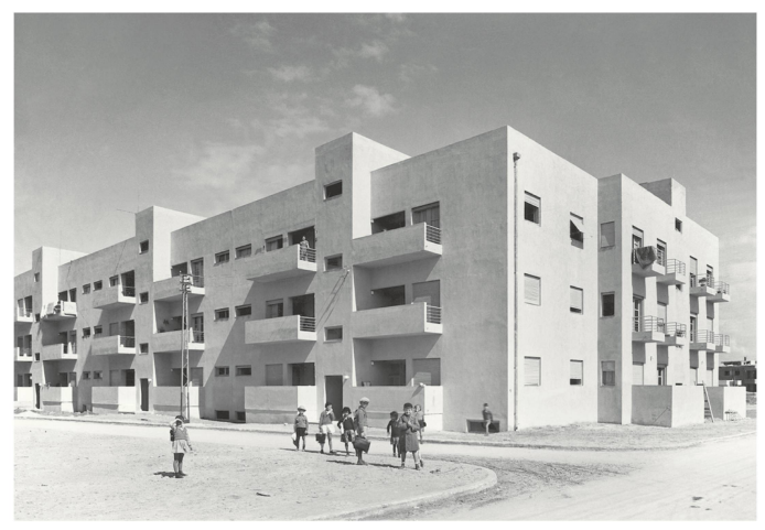
eventually be coined "In- fig. 5 Arieh Sharon, ternational Style." It fit cooperative housing on Frishman Street, well with Zionist practices, Photograph by matching closely with the multi-geocultural origins of its immigrants while also serving as a common formal denominator. The unconditional rationale of modern architecture provided a suitable projec-