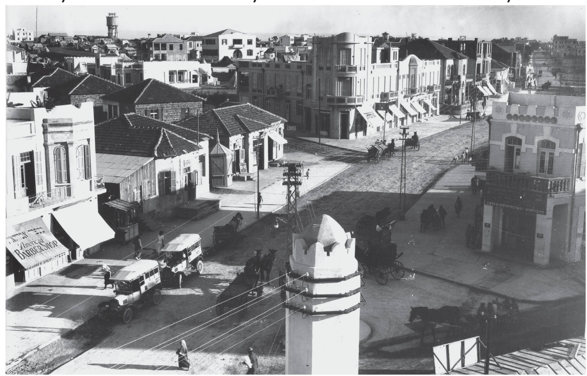
fig. 2 Tel Aviv, Allenby Road, corner Nachlath Binjamin, 1920s.

5 For a huge collection of contemporary descriptions of the city, see Joachim Schlör, Tel Aviv – Vom Traum zur Stadt: Reise durch Kultur und Geschichte (Berlin: Insel, 1999).