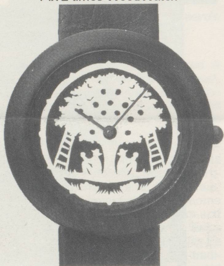
The WoodWatch with "Scherenschnitt" faces.