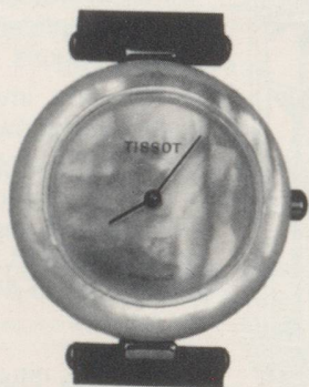
The PearlWatch made out of mother of pearl. A real pearl amongst watches??