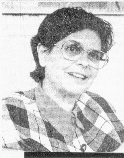
Ruth Dreifuss, the new Federal Councillor.