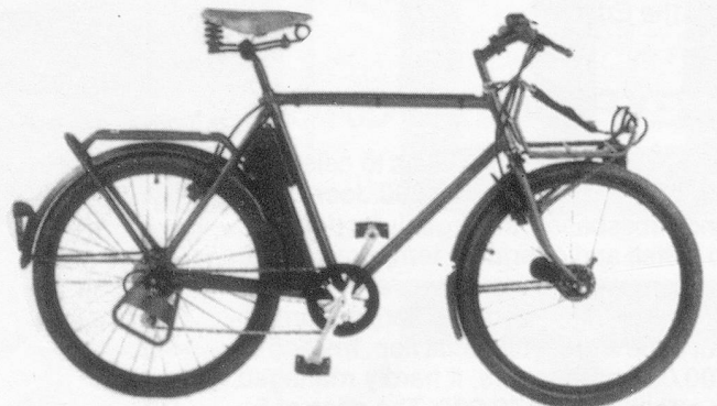
The Swiss Army Bike, a "Göppel" for everyone? Not exactly. Seven gears, 18 kgs. SFR 3000.-. At that price you might as well buy a motorbike.

A "Göppel", as the Swiss soldiers call their bikes, must be able to withstand quite a lot of punishment, so Swiss army bikes have always been built very solidly. This bike is now also available for non-military users. It is green, weighs 18 kgs. has 7 gears, hydraulic brakes and can be loaded with up to 100 kg of baggage. Price tag: a hefty 3000.-SFR. At this price it must undoubtedly be the Rolls Royce among bikes. According to the picture, the price still does not seem to include a headlight, a notorious absence on most Swiss army bikes.PIX