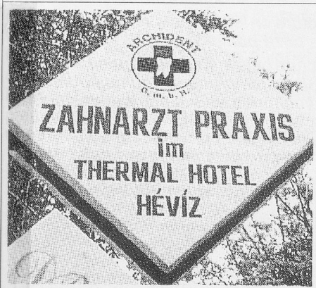
At the thermal hotel "Heviz" even the teeth can take a cure.

To go on holiday to have your teeth attended to is certainly a new kind of tourism and the Hungarians are making the most of it. Realising that having your teeth fixed in a nice place rather than in a drab city is far more pleasant for the patients, Hungarian dentists were quick to open up dozens of new dental clinics and practices in the most sought-after Hungarian spa and holiday resorts. And to better attract their foreign clients, the shields are also written in German as the pictures show.