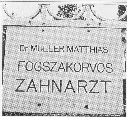
A familiar looking name for a "Hungarian" dentist. Whatever his nationality, his services are much cheaper than in Switzerland.