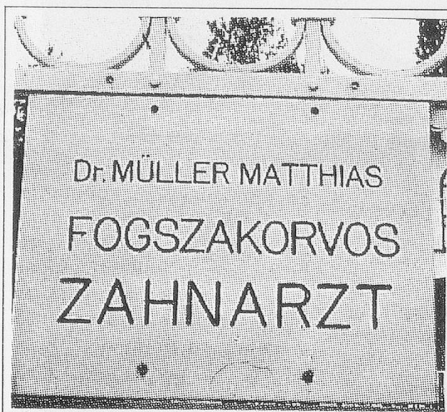
A familiar looking name for a "Hungarian" dentist. Whatever his nationality, his services are much cheaper than in Switzerland.