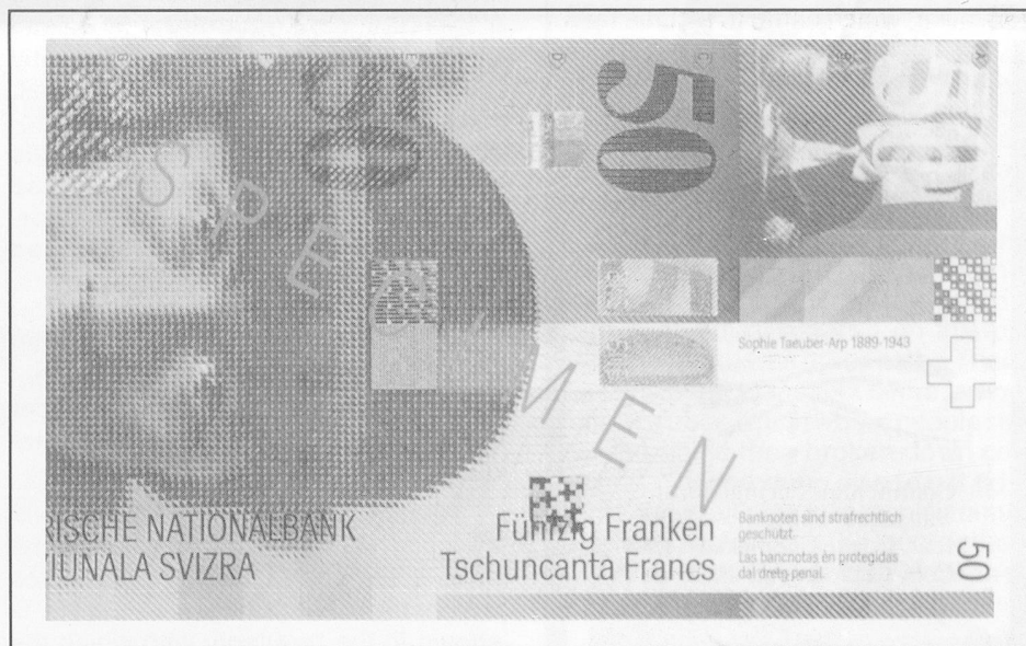
Switzerland's new 50-franc note features Sophie Täuber-Arp, one of the century's leading modern artists.

The first of the new series, already in circulation, is a green 50-franc note. In a year's time, this will be followed by a new, red 20-franc note. The remaining denominations: Sfr. 10 in yellow, Sfr 200 in brown, Sfr 1,000 in violet and Sfr 100 in blue- will subsequently appear in that order at six-month intervals. Switzerland has some 250 million bank notes in circulation, with a combined face value of about Sfr 30,000 million. Of these, the 100-franc denomination is that most widely used. It will be issued last because the Swiss National Bank wants to benefit from experiences with the other notes.