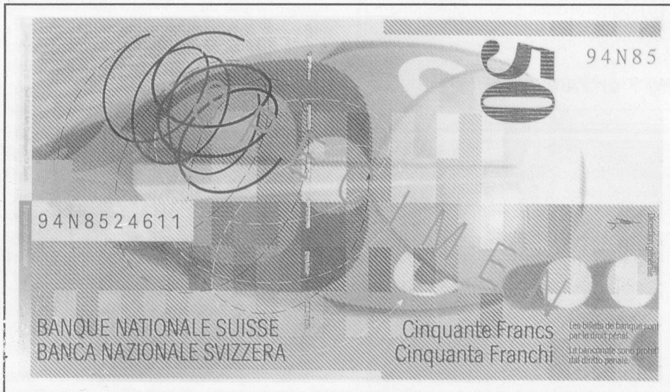
A data-art head forms the background of the note's obverse side.

(Registered at the G.P.O. Wellington as a Magazine) Monthly Publication of the Swiss Society of New Zealand (Inc.) Group New Zealand of the Helvetic Society