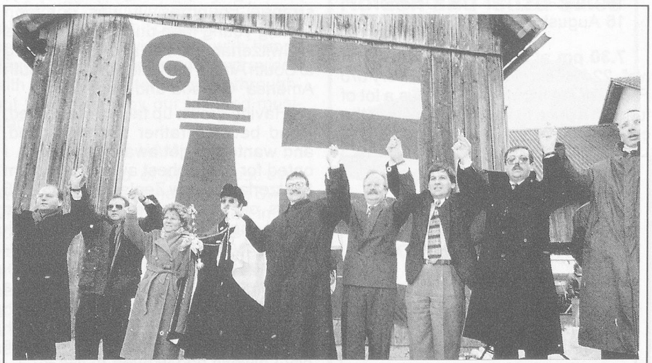
The local Mayor of Vellerat together with members of the Jura Government during the celebrations in front of a huge Jura flag.