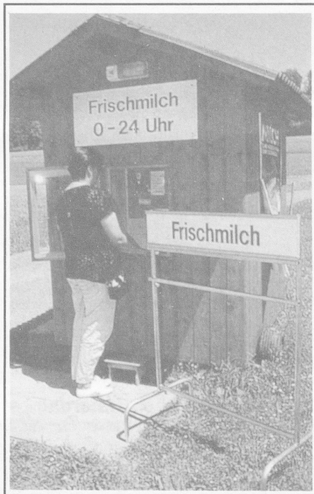
The Milk-Chalet in Oberwil-Lieli where fresh milk is available 24 hours a day seven days a week.

In order to satisfy stringent health regulations, the milk is kept at a strict temperature of 4 degrees centigrades at all times and it is replenished at least twice a day.