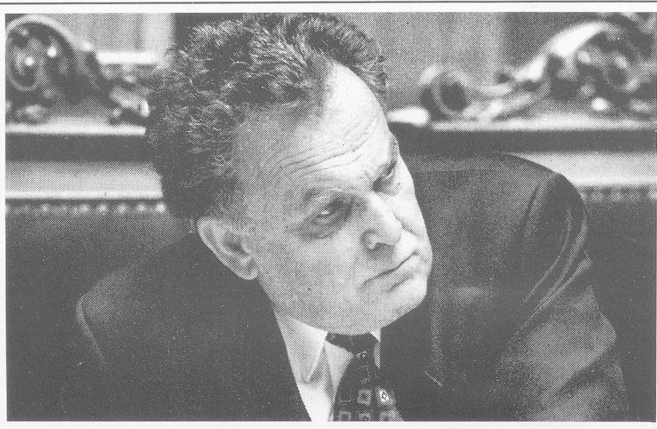
Otto Stich in a typical pensive mood.

To take Otto Stich's position, the joint Government Chambers have elected Moritz Leuenberger from Zurich. The news was received with great enthusiasm in Zurich which welcomed its newly elected Federal Councillor with a frenzy seldom conferred to politicians in Switzerland. Nicknamed "ami du peuple" (friend of the people), rather a curious nickname for a German speaking Swiss, Leuenberger is a well known and well loved public figure in Zurich. It is only to be hoped for his sake that this friendly