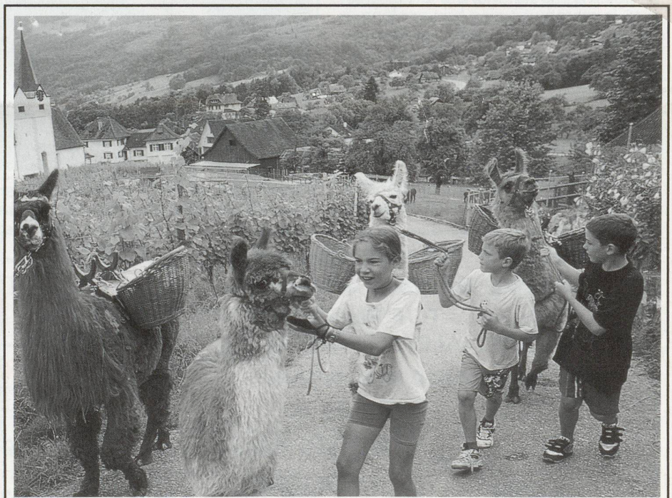
The highlight of the day for the kids: a hike into the St Gallen vineyards with some of the llamas that carry the food for the picnic in the baskets slung over their backs.

Needless to say that the children really love these types of outings. However, the zoo keepers are very careful that the animals do not get stressed by the presence and attention of the children. The interaction between children and animals is carefully assessed so that none of them get tired or fed up with the others.