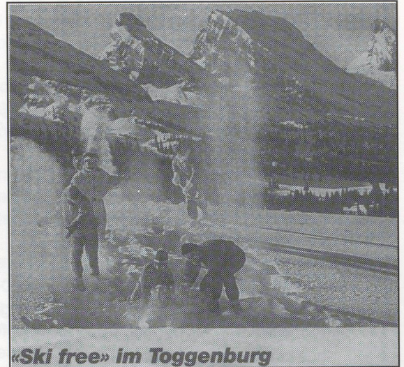
«Ski free» im Toggenburg

An Italian company has allegedly laundered around SFr800 million worth of dirty money through Swiss banks and financial institutions. So far, (18.1.2001) the Italian police have arrested ten people and premises in Switzerland have been searched. Financial institutions in Zurich, Geneva and Lugano are believed to have been involved in the money laundering before the end of 1999. The affair involves an entrepreneur from Naples who ran an import-export company, Italgrani, dealing in cereals.