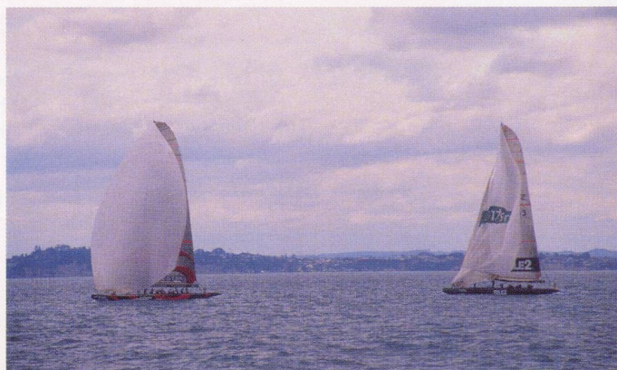
Alinghi leading the Swedish team during the race.