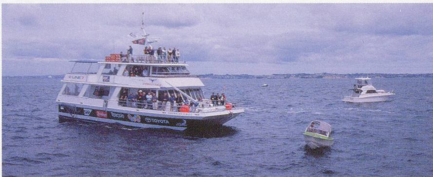
Both big and small were out on the water to watch the action. The little boat's name was 'Frog'.