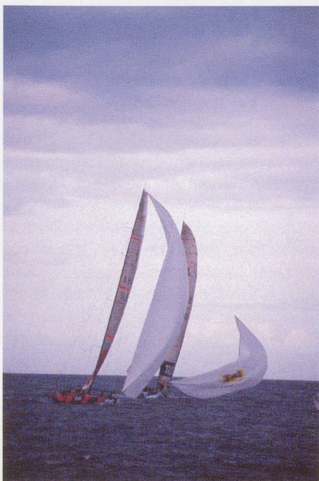
Changing sails during the race.