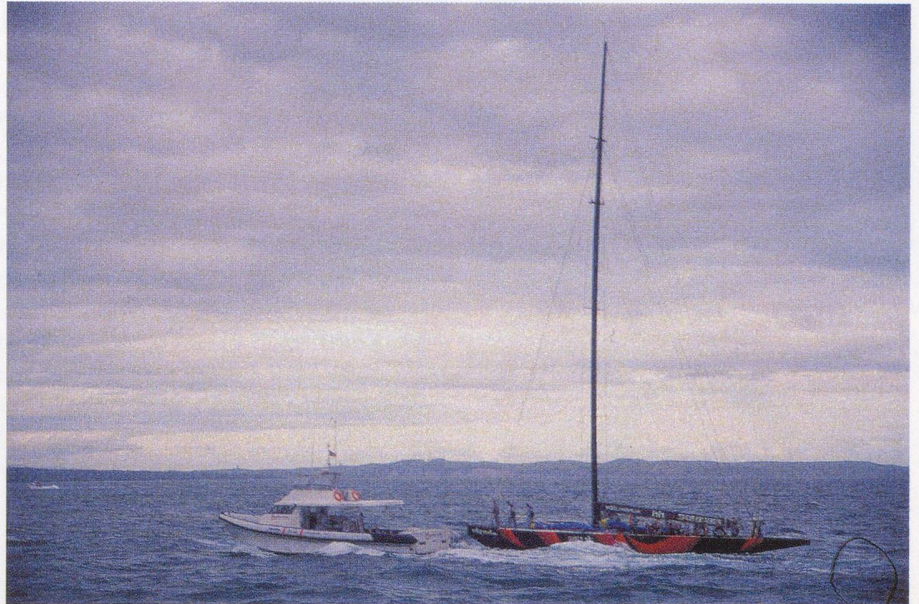
Being towed to the base after the race against the Victory Challenge.