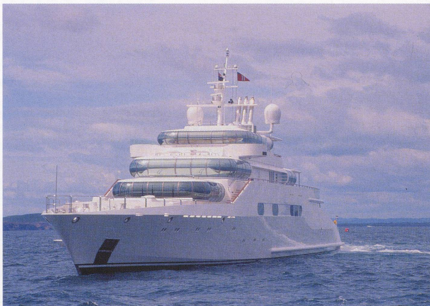
Larry Ellison's incredible yacht that comes out to watch the racing as well.

What an experience, the smell of the ocean, the salty spray, wind in your hair, and then we waited...and waited.