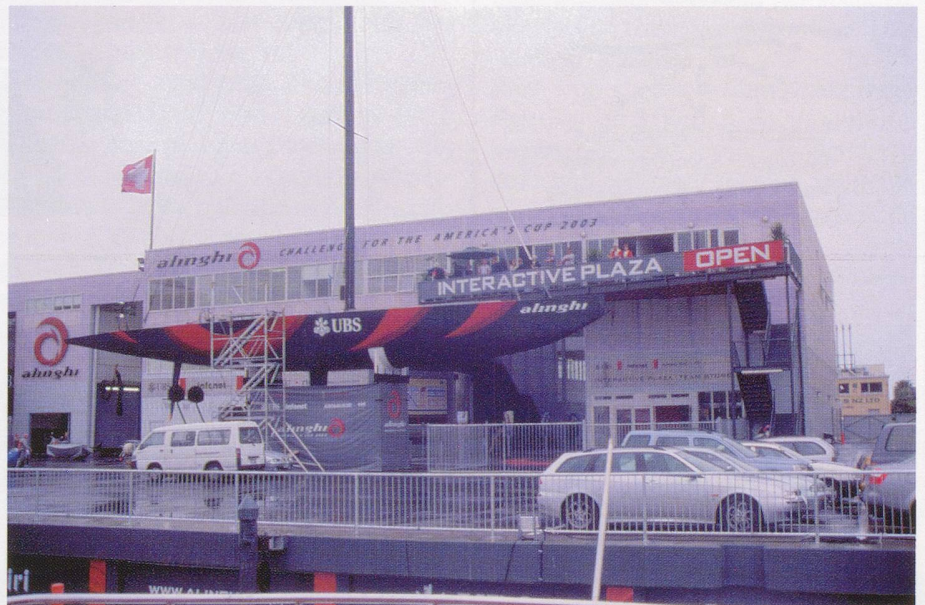
The waterfront side of the Alinghi base in Central Auckland.