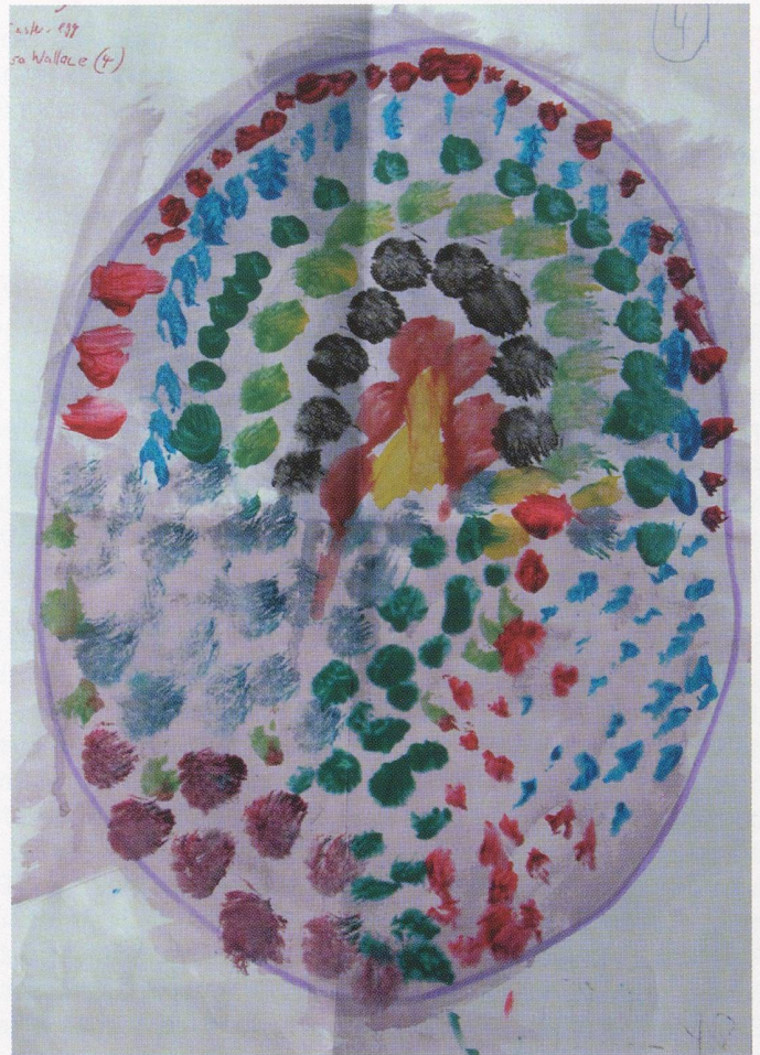
Rosa Wallace (4)