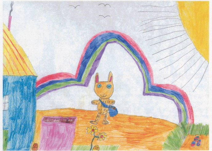
Eliska Blattner-de Vries (7)