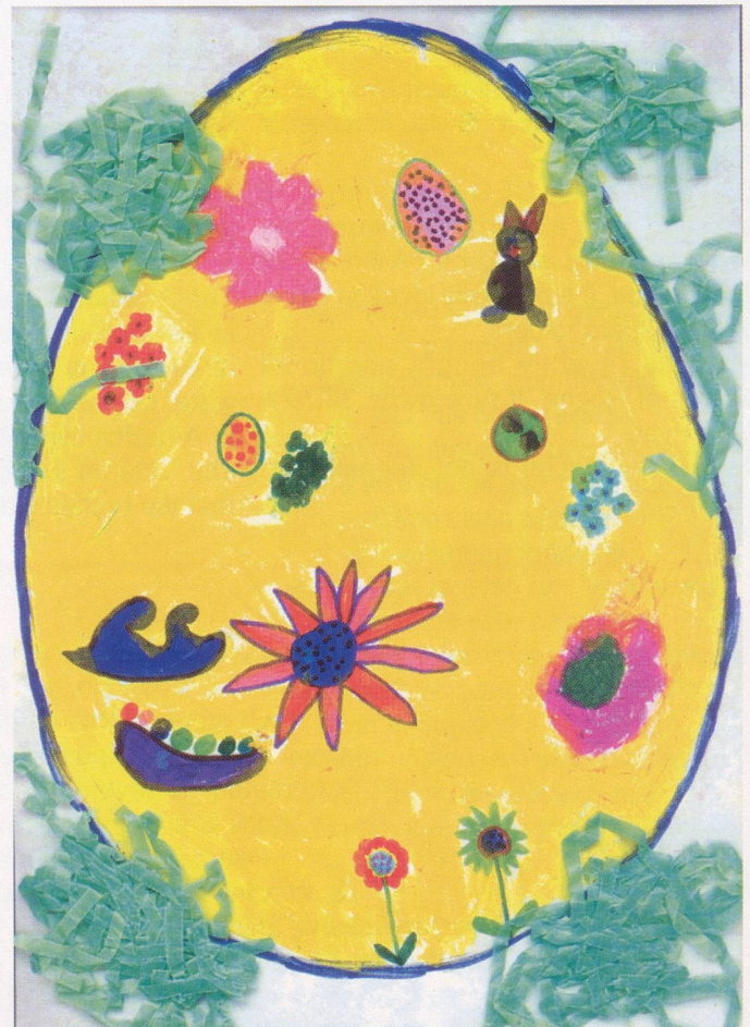
Giulia Eugster (7)