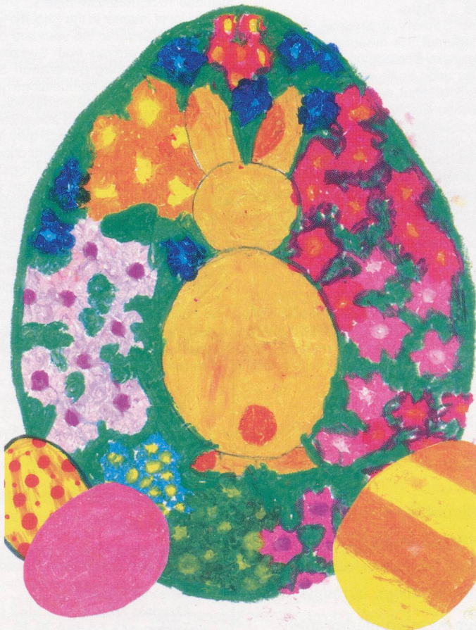
Tanja Eugster (11)