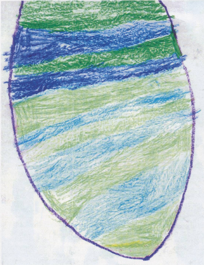
Florian Hurschler (5)