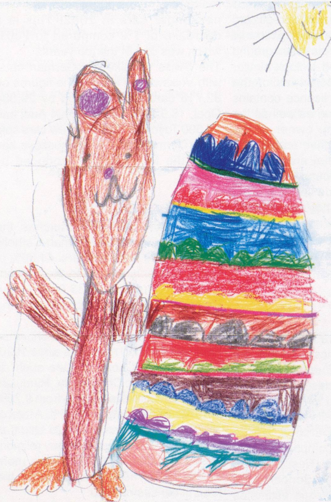
Judith Hurschler (6)

To find out the winners in the story competition turn to page 15