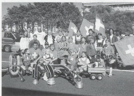
Many of our younger members in Swiss costume ready to walk in the multi-ethnic parade, with the beautiful bells in front, together with several Swiss flags.