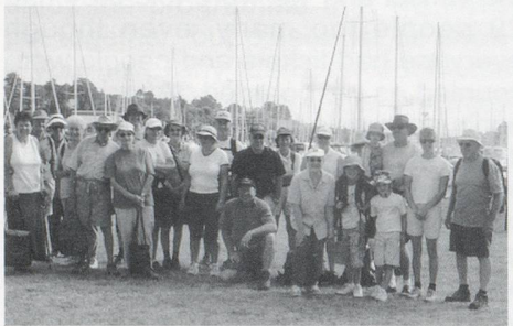
The family walk group photo