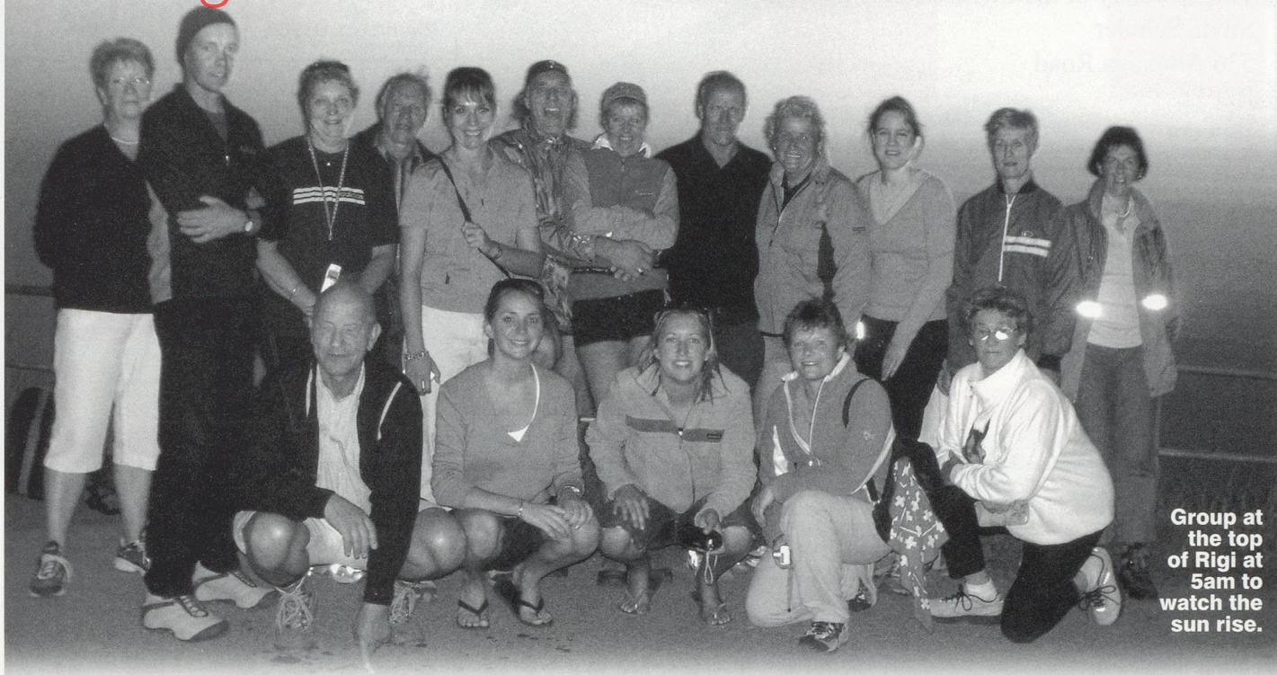
Group at the top of Rigi at 5am to watch the sun rise.