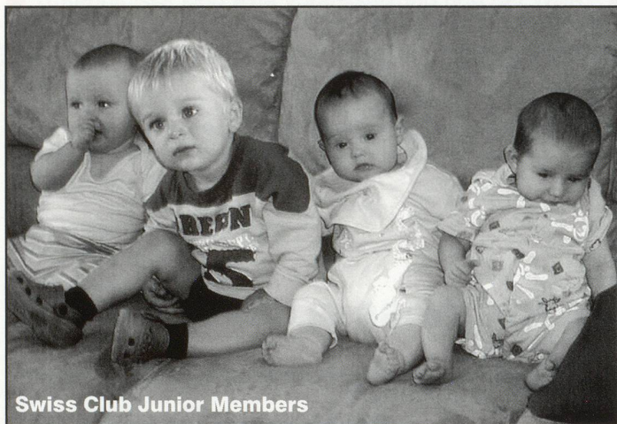
Swiss Club Junior Members