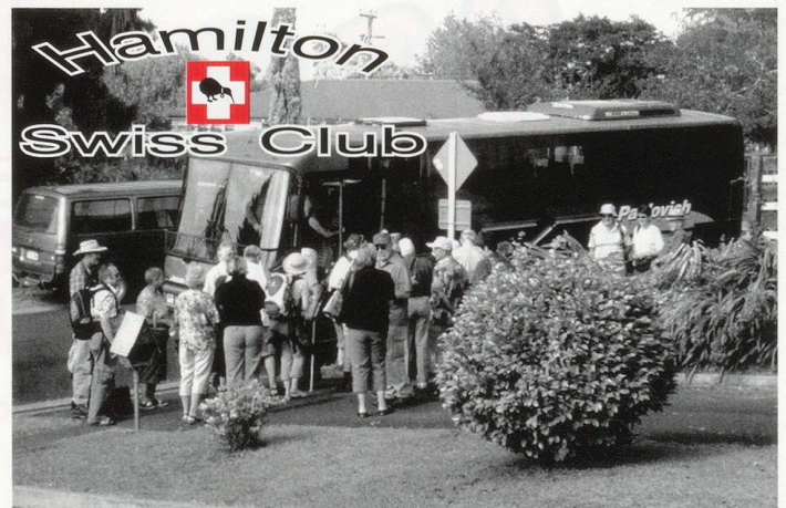
Hamilton Club: Swiss Farmers saying goodbye to their host families.