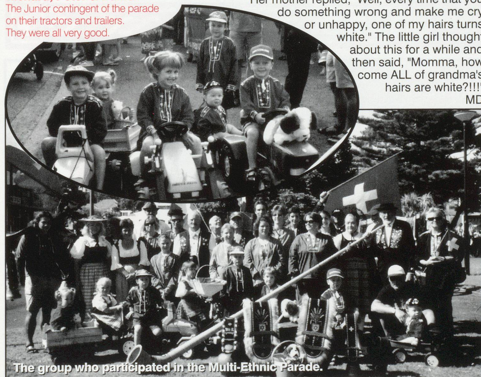
The group who participated in the Multi-Ethnic Parade.