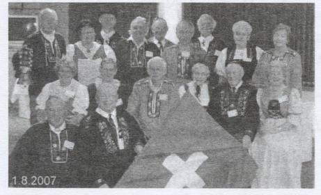
First of August function – everyone who came dressed in national costume.

And to complete the ambiance of the evening, our musical entertainment came from our very own