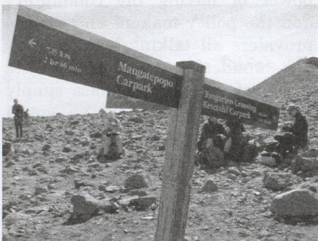
Some of the trampers having a rest during the Tongariro Crossing