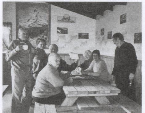
The jassers... the Taranaki lot still smiling after their narrow loss

... but they could just be deceiving us!!! The next morning we left bright and early to ensure that we would be at the farm at Kaupakapaka in time to compete in the final of the Cowbell Competitions ... we had already won the shooting, and the remaining disciplines were shot put, keglen and jassen. The keglen soon got underway, with the jassen not far behind. There were four jassers from each club ... our team was made up of four ladies, while the Aucklanders were a male dominant team ... now, although the scores were even, the Aucklanders won on a points difference ... ladies, our men might well say,