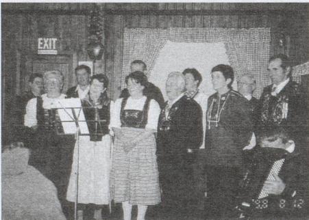
The singing group performing on the 1st August 2008

This year we held the Swiss National Day celebrations on the actual day - 1 st August - with an excellent crowd of approximately 85 adults and children. Many people wore Swiss costumes, which helped create a great atmosphere and made the hall look very colourful. All our sixty 1 st August badges were sold, amid people having a glass of wine or beer with lovely traditional background music. The table decorations were lovely, and brought even more colour to our nice hall. The formalities of the evening commenced, with the speech from the President of the Confederation, Mr Pascal Couchepin, which was short, informative and interesting, fol-