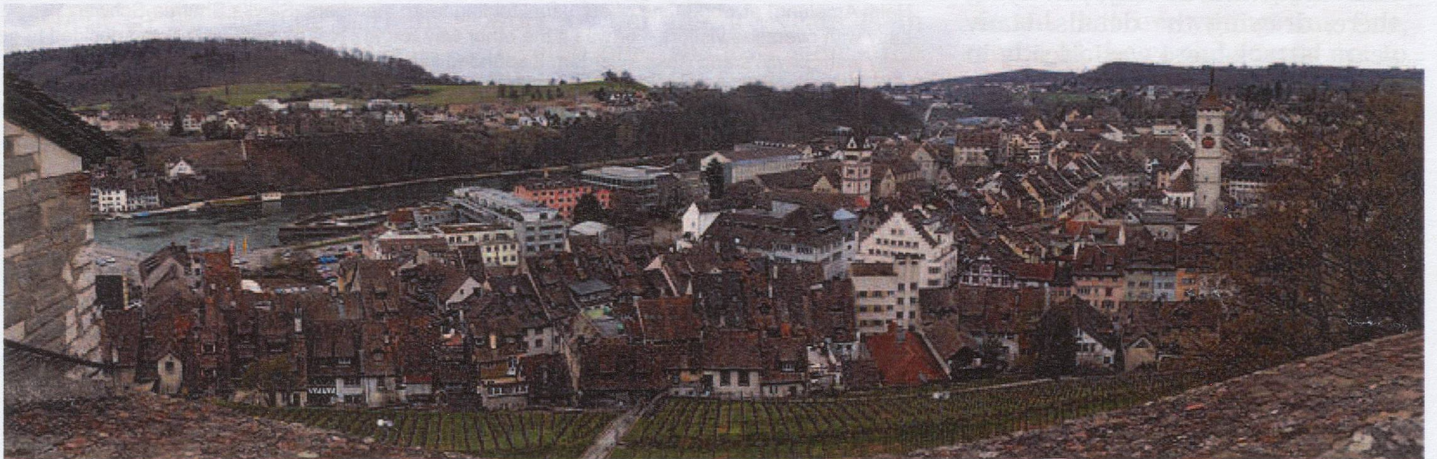
View of the city of Schaffhausen from the Munot

Switzerland. It is mostly productive agricultural land. It lies almost entirely "on the other side" of the river Rhine.