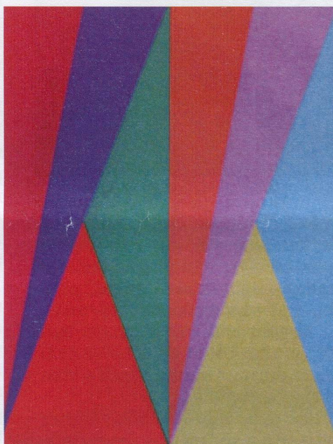
San Lazzaro by Max Bill