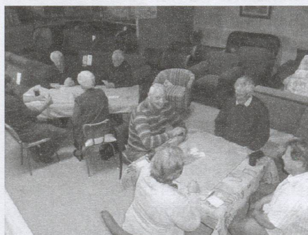
Both teams playing cards

lost. Next was the Shotput which Hamilton won fairly convincingly and because Hamilton had already won the shooting the pressure was on either team to win the Cards but luck wasn't our way and Auckland won this, also