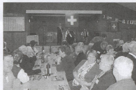
Matangi Hall decorated for the AGM and Fondue Evening