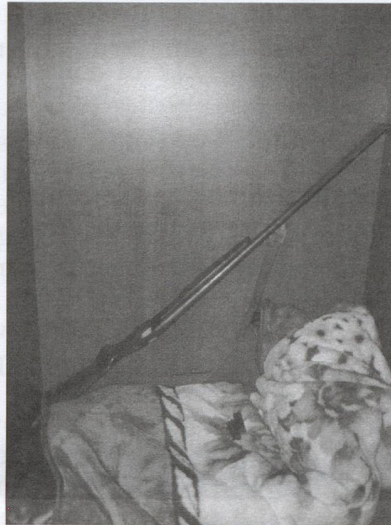
The gun in the wardrobe in Albania

Albania were heavy with litter, Bulgaria tidier and Romania tidier still. Of course, people have their stereotypes