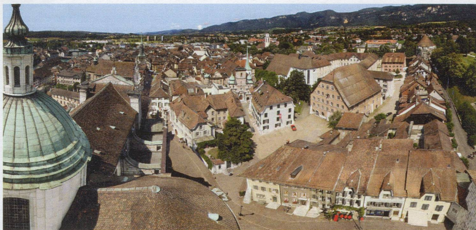
The city of Solothurn with the St Ursus Church on the left

canton of Baselland. Two of the districts are enclaves and are located along the French border.